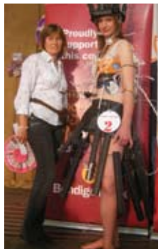
▲ 'Fancy Fencing'.

We were also pleased to continue to support the national competition by awarding the runner up in each of the following national sections – avant-garde, designer and under 21 a cheque for $150. This money provides assistance for the recipient to further their studies in the art and textile area in relation to their creative work.