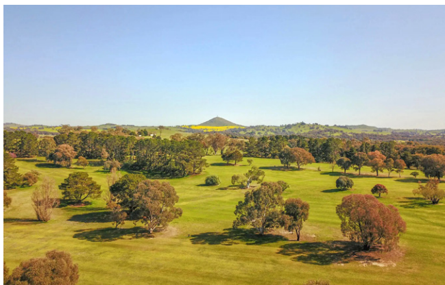
Beautiful Binalong Community Club will host the World Sand Greens Championships in September.

We are delighted that this major sporting event will be held here in our region, and we're proud to support it.