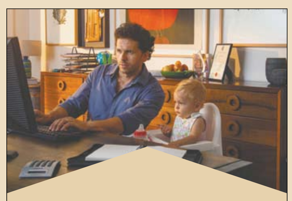
Bright Community Bank® Branch

Bright Community Bank ® Branch in conjunction with our Myrtleford Agency supported the Beyond Blue Foundation when they conducted an informal presentation evening in Myrtleford in April. Beyond Blue, a national depression initiative, hosted a function held at the Myrtleford Savoy Sporting Club, with key speakers addressing the issue of depression and where to find help and support. It was a valuable and well attended evening.