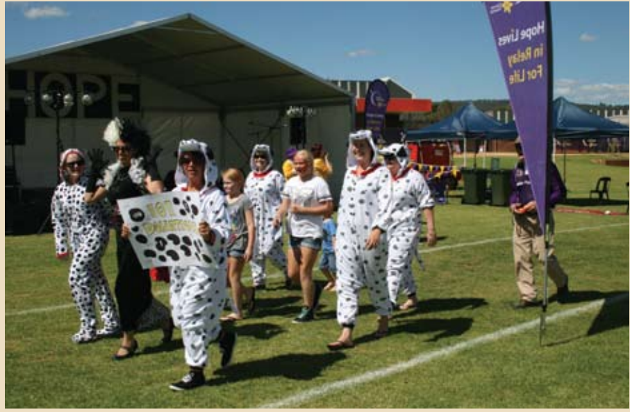
Top: Fairies and Cars. Above: Team 101 Donations.