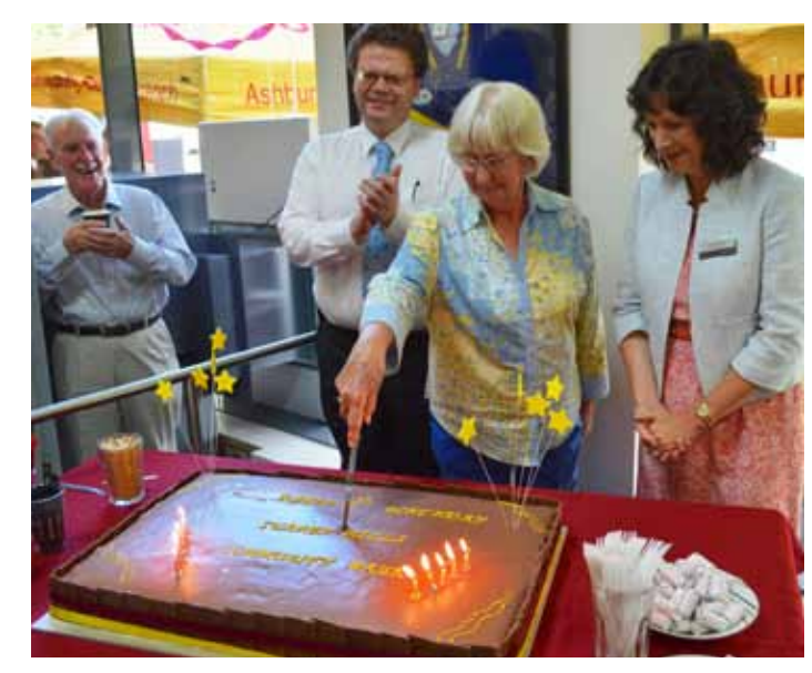
Birthday cake, coffee, singing & special guests- all part of Surrey Hills Community Bank ® branch's 10th birthday celebrations.

Over 10 years our Community Bank ® branches have grown up to be strong and will be able to do so much more in the next 10 years.