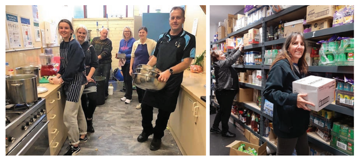
Volunteers at Foothills Community Care Community Casseroles (left) and Dandenong Ranges Emergency Relief Service (right).

Another great initiative this year has been the support of two local charities who provide much needed assistance to those doing it tough. In May the Board provided $2,500 to Dandenong Ranges Emergency Relief Service (DRERS) and to Community Casseroles operated by Foothills Community Care.