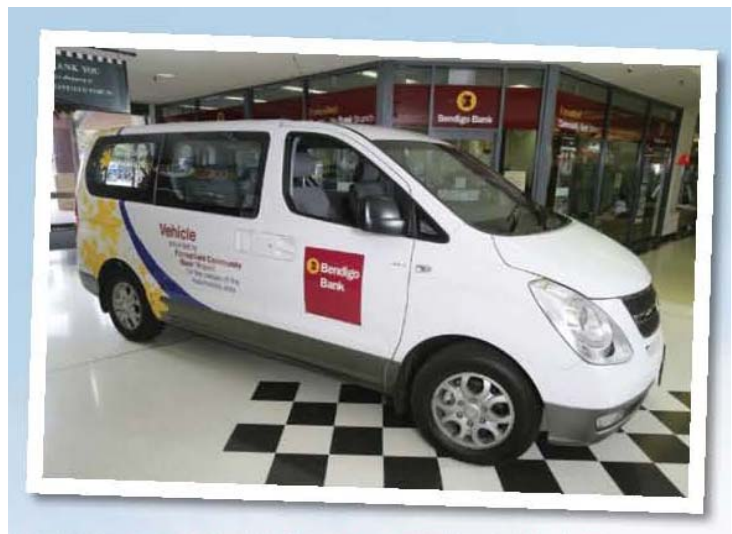
We encourage local residents to take advantage of this new Transport to Treatment service.

We were proud to be able to provide this vehicle for use by the Cancer Council of Western Australia to facilitate the movement of patients from the Foothills and Hills to medical appointments in the city.