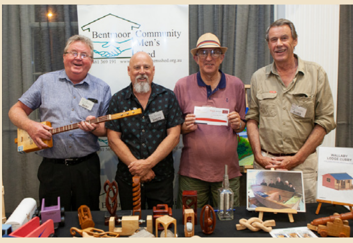
The guys from the Bentmoor Men's Shed.