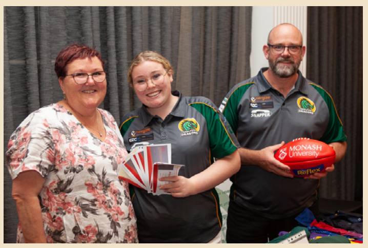
The happy crew from Oakleigh Dragons Football Club.