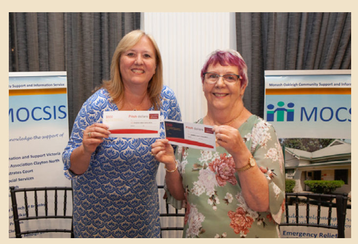
Monash-Oakleigh Community Support were happy recipients on the night.