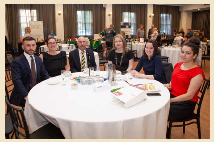
Some of the team from Bailey Timms at the Community Pitch.