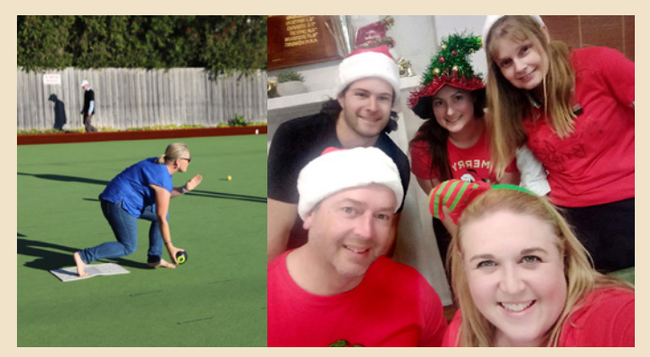
Festive fun at the Murrumbeena Bowls Club's Community Bowls in December.

We take this opportunity to wish our shareholders, customers and local community partners a safe and happy festive season and all the best for 2020. We hope you enjoy a well-earned break.