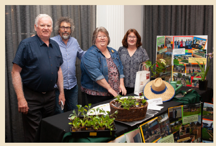
The team from the East Bentleigh Village Garden.