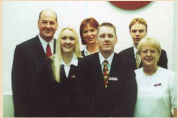
Original staff of Strathmore Community Bank® Branch.