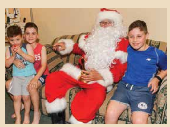
Left to right: Santa visits Strathmore.