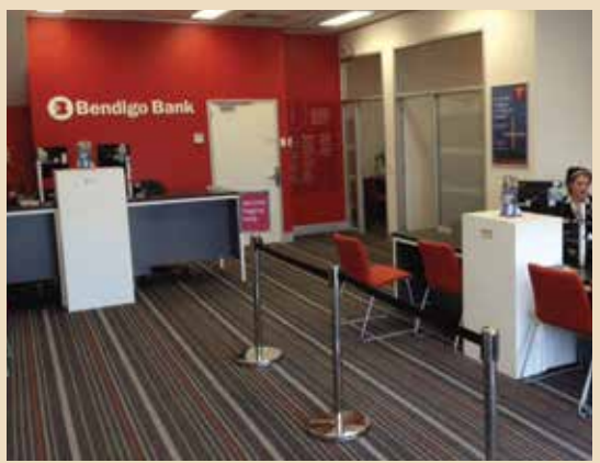
Above row: Renovations at Strathmore Community Bank® Branch.