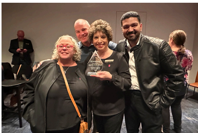
Staff attended the regional awards to collect their trophy

Congratulations to our Aspendale Gardens–Edithvale team on winning the award for Operational Excellence, Melbourne Peninsula Region at Bendigo Bank's recent Regional Awards Night. We are very proud of them and they great work they do every day to support our customers and community.