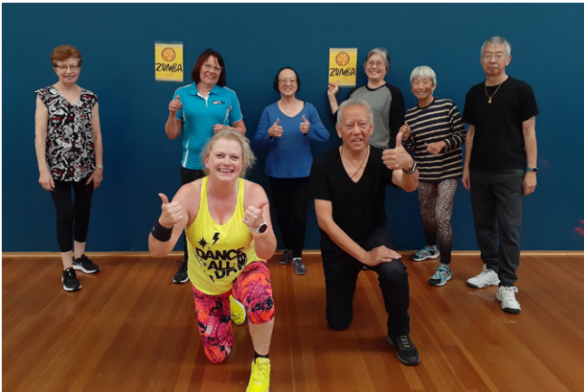
Local seniors took part in a Zumba class as part of Victorian Seniors' Festival activities

As part of the Victorian Seniors' Festival, Aspendale Gardens Community Service provided free local events for seniors over the month of October which included, Zumba (pictured below), Chair fitness and Walk it, Snap it, Pain it classes. We were proud to be sponsors of this event which brought local people together for fun, fitness and company.