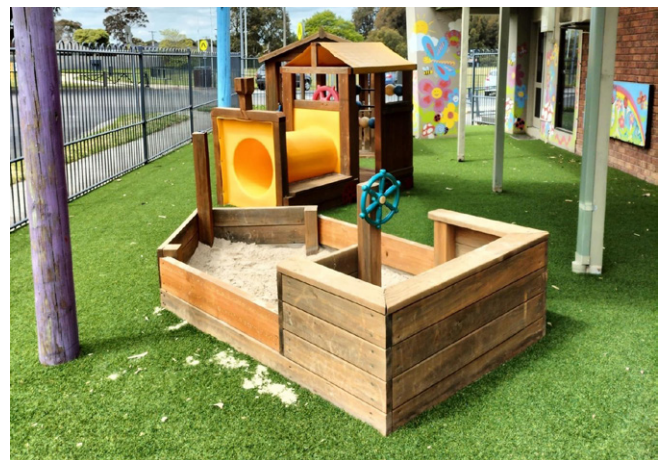
The playground refurbishment at Chelsea Heights Community Centre

Thank you also to the team at Community Bank Aspendale Gardens-Edithvale for their generous donation which also helped us to complete the work needed. This upgrade of our playground will benefit all our children and family groups and the wider community.