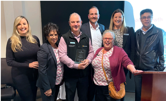
Above: Our team picking up an award at Bendigo Bank's Regional Awards in July 2021