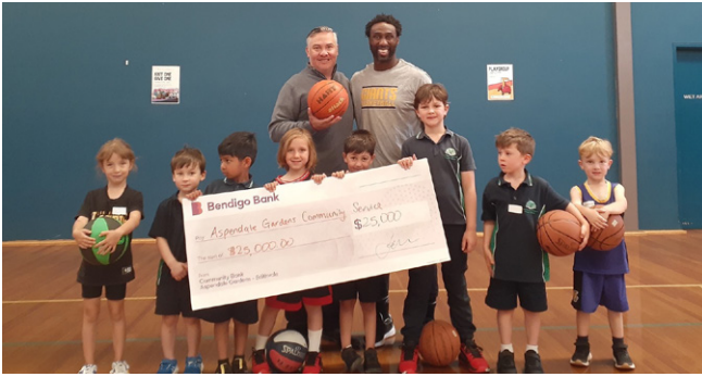
We're proud to support Aspendale Gardens Community Service