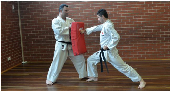
We're proud to support JKA Bayside