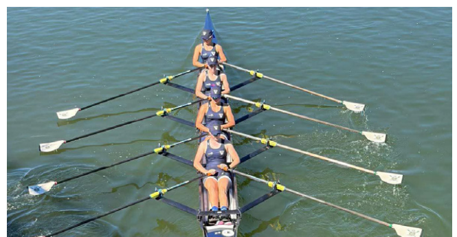
We're proud to support Carrum Rowing Club

Download the Bendigo Bank app and open an Everyday Account to get started. When choosing to link to your branch, be sure to nominate Community Bank Aspendale-Edithvale. That way your banking will be helping our community.