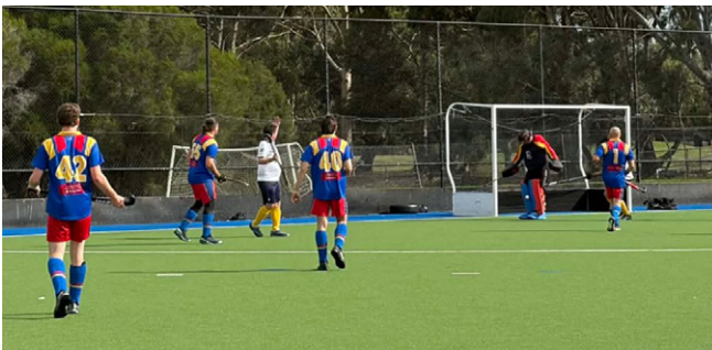
We're proud to support St Bede's Hockey Club