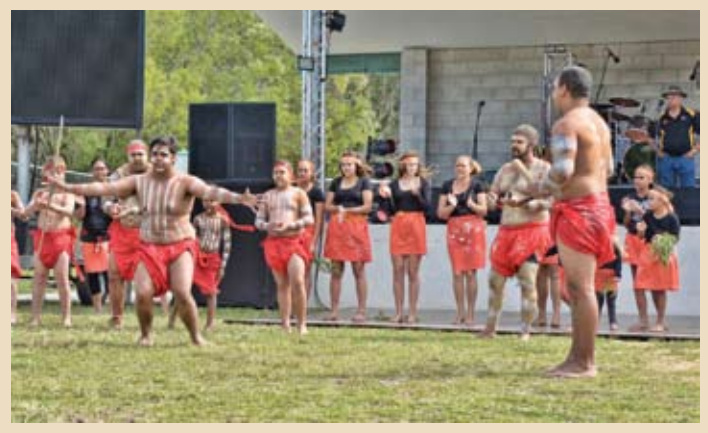
Gooreng performers performing the welcoming dance at the Captain Cook 1770 Festival.

The Agnes Water/1770 Community Bank <sup>®</sup> Branch Stage is available for anyone to use just by making a booking at the RTC/Council office.