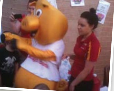
Piggy at Braitling School Fete.