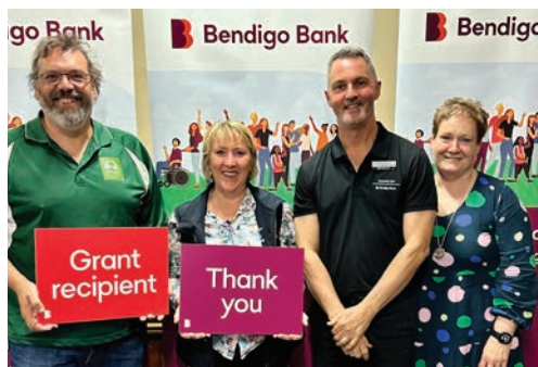
Kooreh Memorial Hall