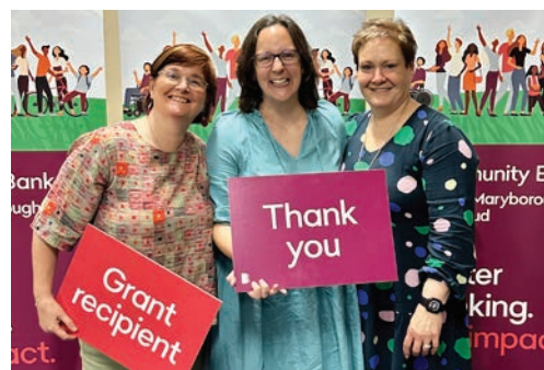
Maryborough Theatre Company