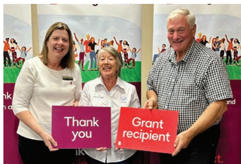
Maryborough District Girl Guides

"Congratulations to all of the recipients. The positive impact of these projects will be felt across the region, fostering collaboration and enriching the lives of our community."