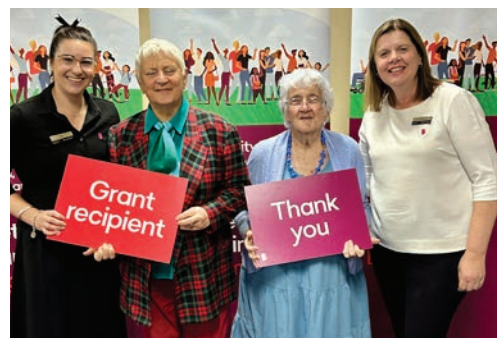
Maryborough Midlands Historical Society