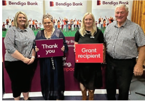
Carisbrook Disaster Recovery Committee Inc.