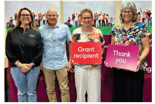
Central Goldfields Bushwalking & Hiking Club Inc