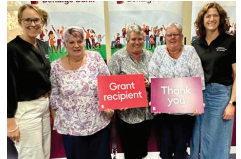
Avoca & District CWA