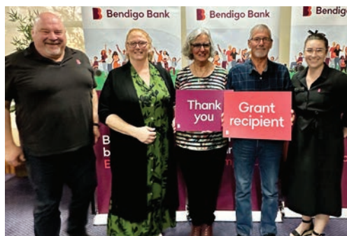
Avoca Riverside Market