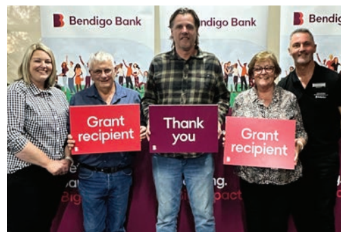
St Arnaud Historical Society