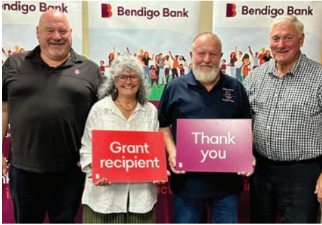
Moonambel Arts and History Group Inc.