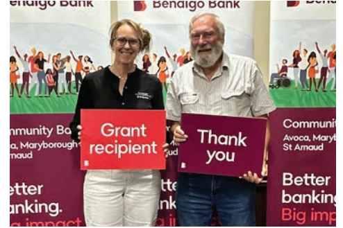
St Arnaud Community Resource Centre