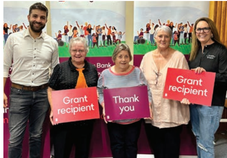
Maryborough Family History Group