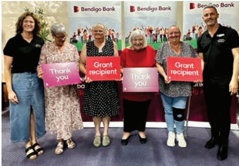
Saint Arnaud Community Kitchen