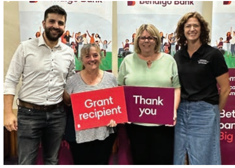
Stuart Mill Progress Association