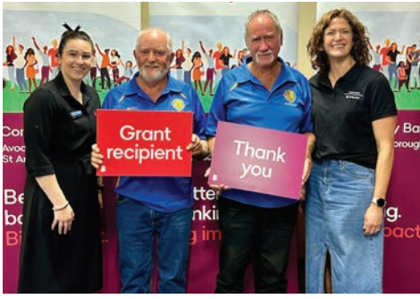
St Arnaud Lions Club