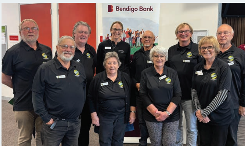
Maryborough Volunteer Resource Group