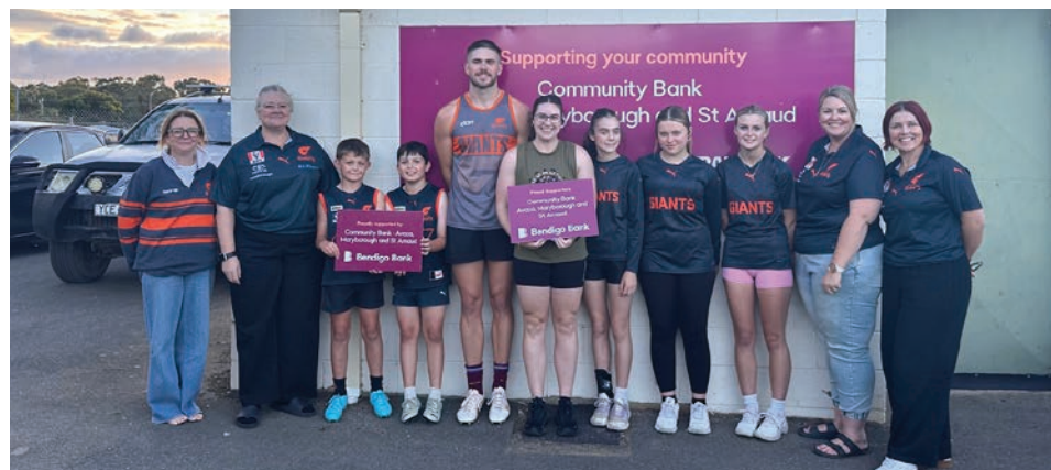
Maryborough Giants Football Netball Club