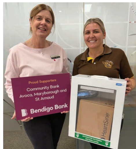
Talbot Football Netball Club