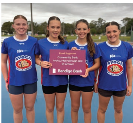
Avoca Football Netball Club