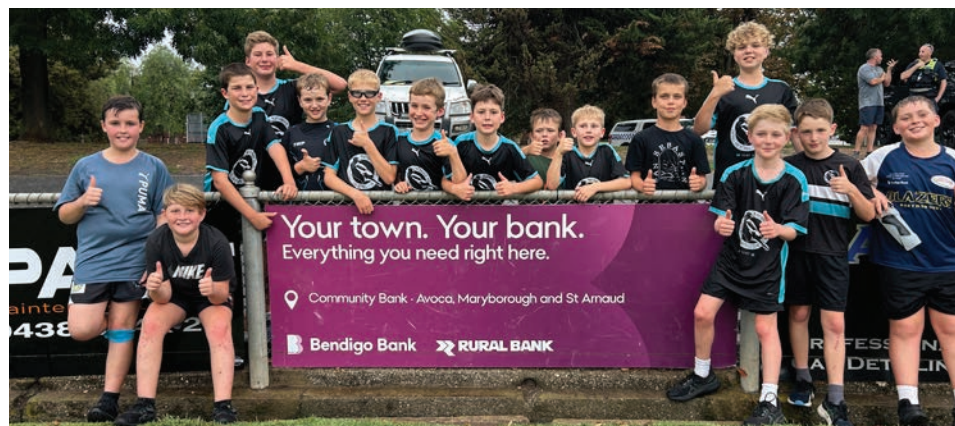
Maryborough Junior Football Netball Club