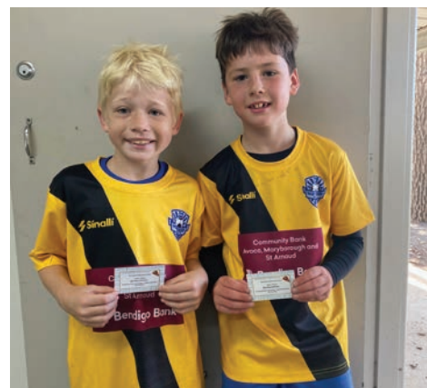
Maryborough Soccer Club