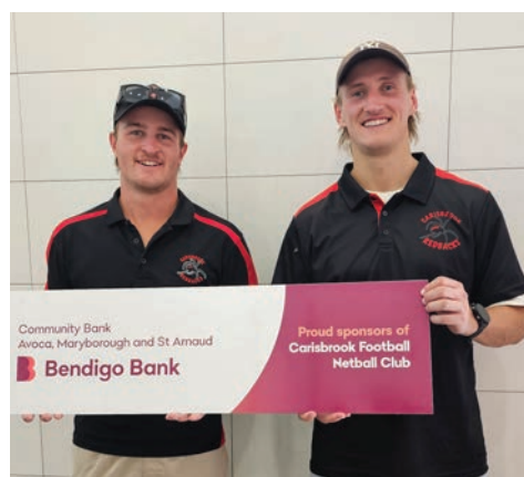
Carisbrook Football Netball Club