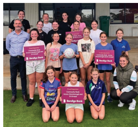
St Arnaud Netball Club