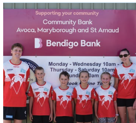
Natte Bealiba Football Netball Club