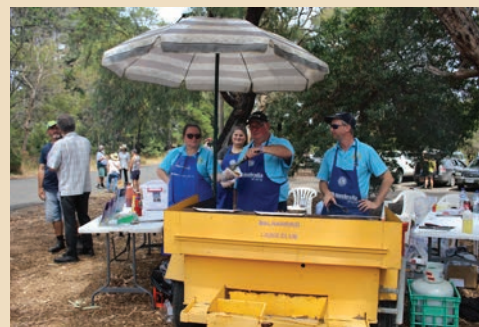
Hard-working Balnarring Lions Club members.