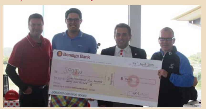
On 24 April a large group of enthusiastic golfers gathered at the beautiful Flinders Golf Club for our annual Corporate Golf Day. Balnarring & District Community Bank® Branch, Mt Martha Community Bank® Branch and our regional Business Banking team sponsored the event and invited customers and friends for a hotly-contested golf competition, raising $1,425 for 'Spot a', a community awareness program that helps spot the early of signs of depression.