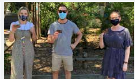
Top: Our Boomerang Bag members with their Love Local cards. Above: Both Balnarring and Somers Primary School teachers with their Love Local cards.