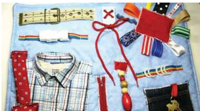
Detail of a 'fiddle quilt' made with tactile items.

Email: secretary@bayquilters.com.au www.bayquilters.com.au