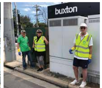
Before and After: Impressive results from the Graffiti Busters in Beamaris.

Beamaris Community Financial Services Limited | 32 East Concourse, Beamaris Vic 3193 | ABN 25 100 506 643