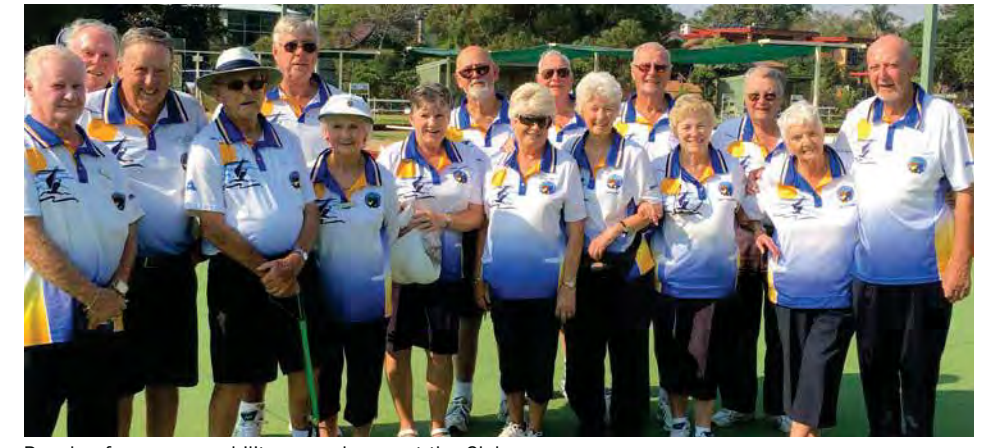
People of any age or ability are welcome at the Club.