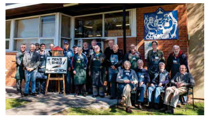
Members of the Bayside Men's Shed.

Open 9am – 12.30pm weekdays 36 Bonanza Road, Beaumaris www.baysidemensshed.com