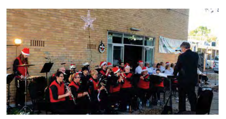
The Southern Area Concert Band in full swing.

Proceeds went to the Christmas Bowl Appeal and the Farmers Drought Appeal.