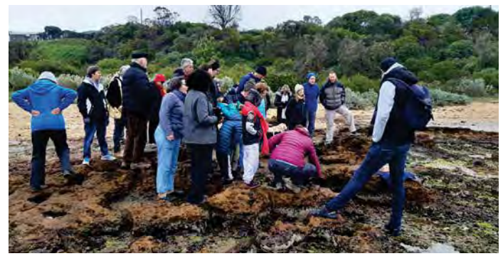
Fossicking for fossils.

Bookings at: www.beaumarisfossils.org/bulletin-board