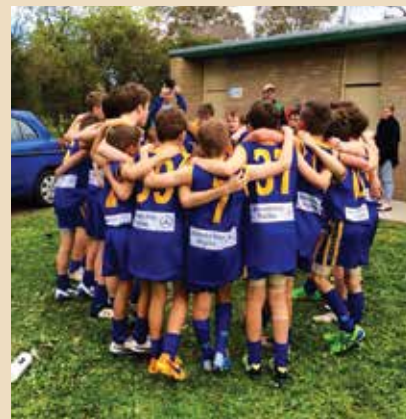
U12s after winning the 2015 premierships.

The club welcomes all supporters and players. To keep up to date with the latest news, fixtures and events go to: www.beaumarisfc.com.au or 'like' them on Facebook: www.facebook.com/beaumarisfootballclub