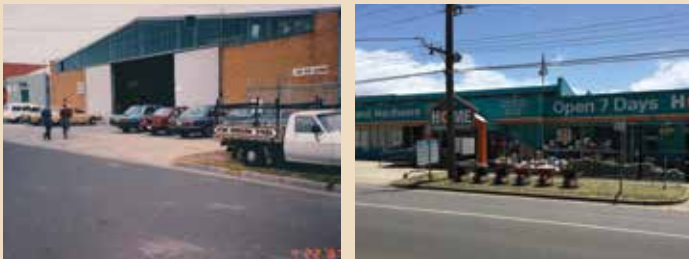
Then (1987) and now.

Park Road Timber and Hardware, 21 Park Rd, Cheltenham, 3192 Ph: 9584 8855 | www.parkroad.net.au