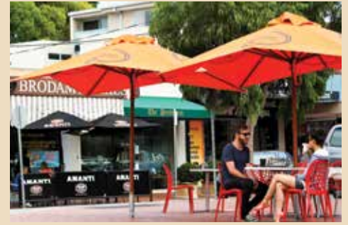
Improvements are on the way for the Concourse.

For further information go to: www.yoursaybayside.com.au/beamaris-concourse-masterplan