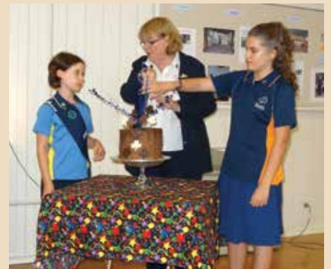
Beaumaris Girl Guides making leaders of tomorrow.

On 6 September 2014, the Beaumaris Girl Guide Hall was attacked by arsonists. This special building, a place of learning, friendship, and community, suffered severe damage and many of the sacred contents important to the group's traditions and history were destroyed.