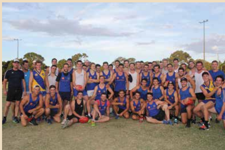
2016 senior players at training.