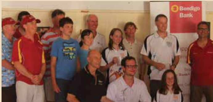
Winners are grinners.