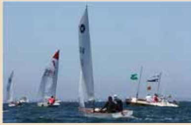
Getting to the start line.

3193 Sailing Cup was sponsored by Beaumaris Community Bank ® Branch again this year. This hugely successful event in February pitted Black Rock Yacht Club against Beaumaris Yacht Club (BYC).