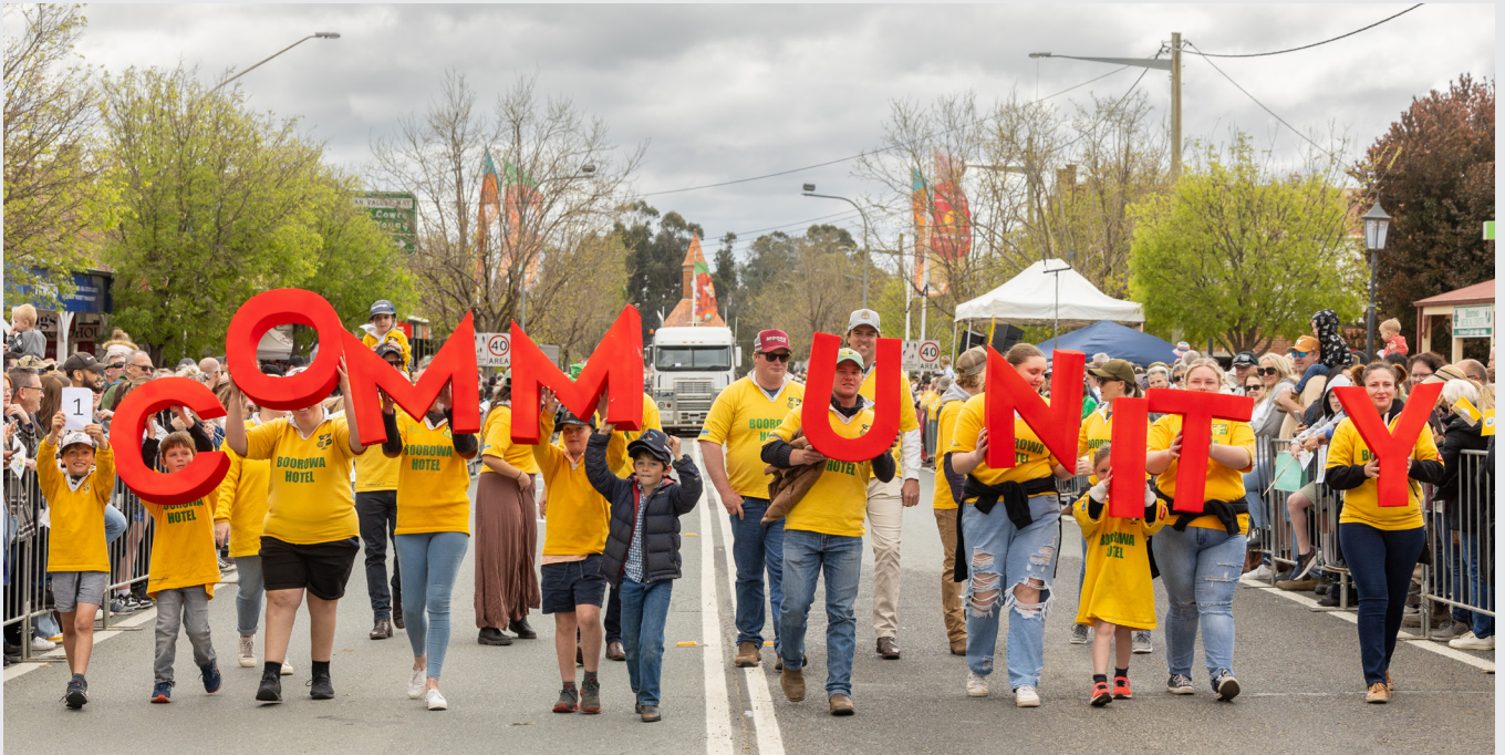
Boorowa Irish Woolfest