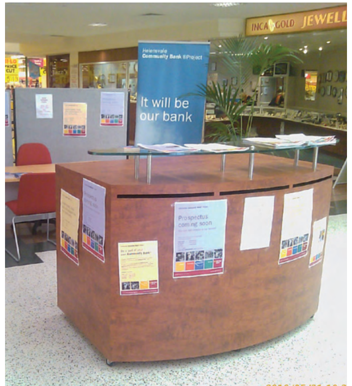
▲ Kiosk at Helensvale Plaza Shopping Centre.

Date to note: Broadwater Financial Services Ltd Annual General Meeting: Wednesday 24 November 2010.