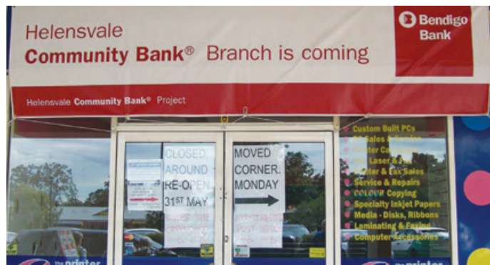
▲ Helensvale Branch site.

The sooner the local people show their support by purchasing shares or transferring their banking business to the Community Bank ® branch, the sooner the Community Bank ® branch will become a reality.