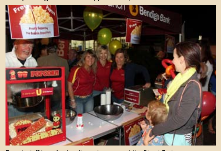
Branch staff have fun handing out popcorn at the Street Party.

Your Buderim Community Bank ® Branch also saw the evening as an opportunity to say thank you to our valued customers and the Buderim community for recognising the importance of banking locally. As a gesture of our appreciation, we invited Buderim locals