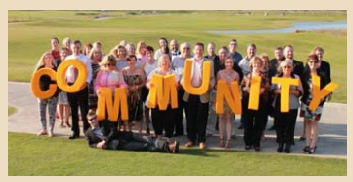
The regional team celebrate at the Awards.