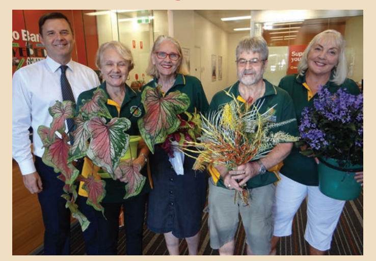
Buderim Garden Club members pay a visit to the branch.

Open Gardens, another Festival highlight is the competitive Spring Flower Show of cut flowers, hanging baskets, bonsai plants, photographs and children's entries. There will also be a quality plant market adjacent to the Buderim War Memorial Hall, while at the Craft Cottage, Buderim's potters and sculptors will present their annual exhibition.