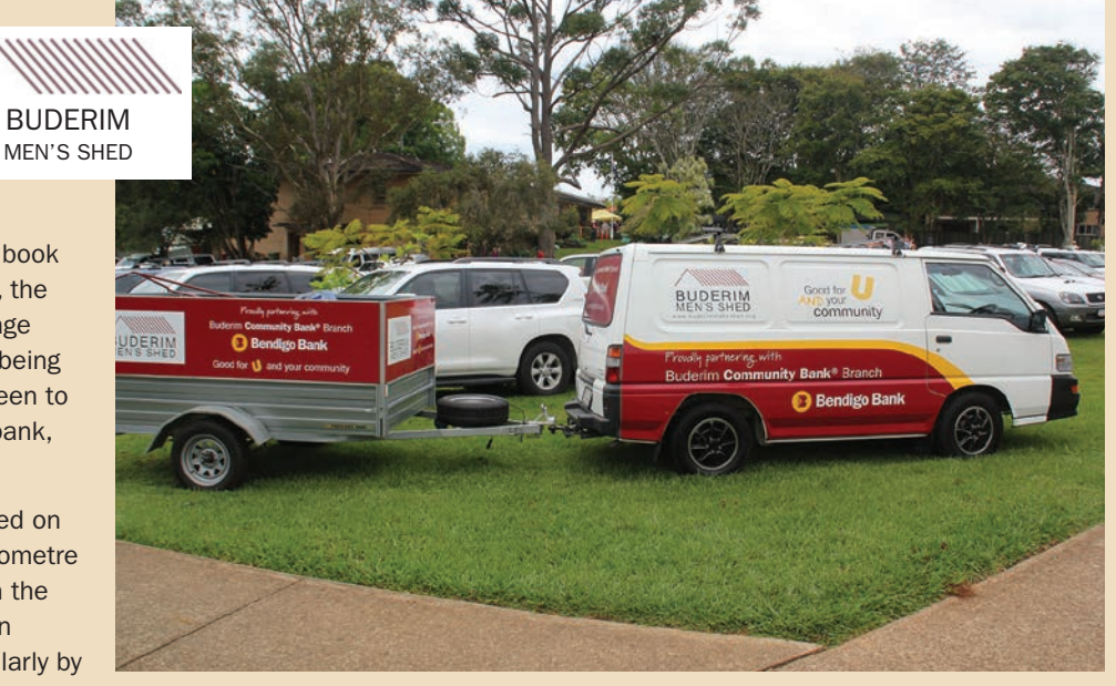
The Buderim Mens' Shed van and trailer continues to service the local community.

and are truly thankful for your generous decision to support our Shed in this manner. Whilst it is difficult to assess the promotional benefit to your bank, I feel certain that it has been an investment of 'untold benefit', and ongoing on a daily basis – sharing the good publicity that the Buderim Men's Shed enjoys in the Buderim community.