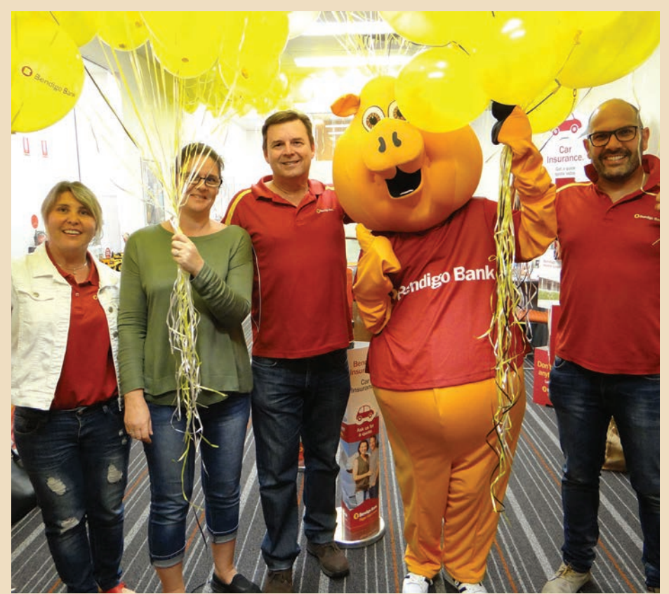
Our branch team gears up for the Street Party.