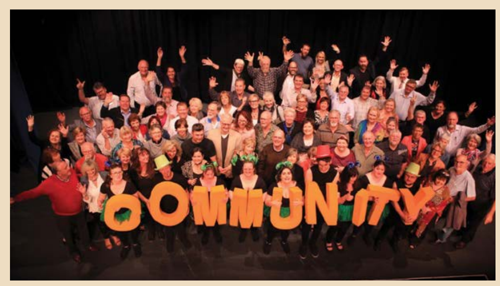
We understand how important it is to create shared value in a community.

The Shared Value Award is the latest award to recognise Bendigo and Adelaide Bank's good corporate citizenship. The bank has also been named in the FORTUNE Annual 'Change the World List of companies that are 'Doing Well By Doing Good' as the top Australian company on the globally acclaimed list.