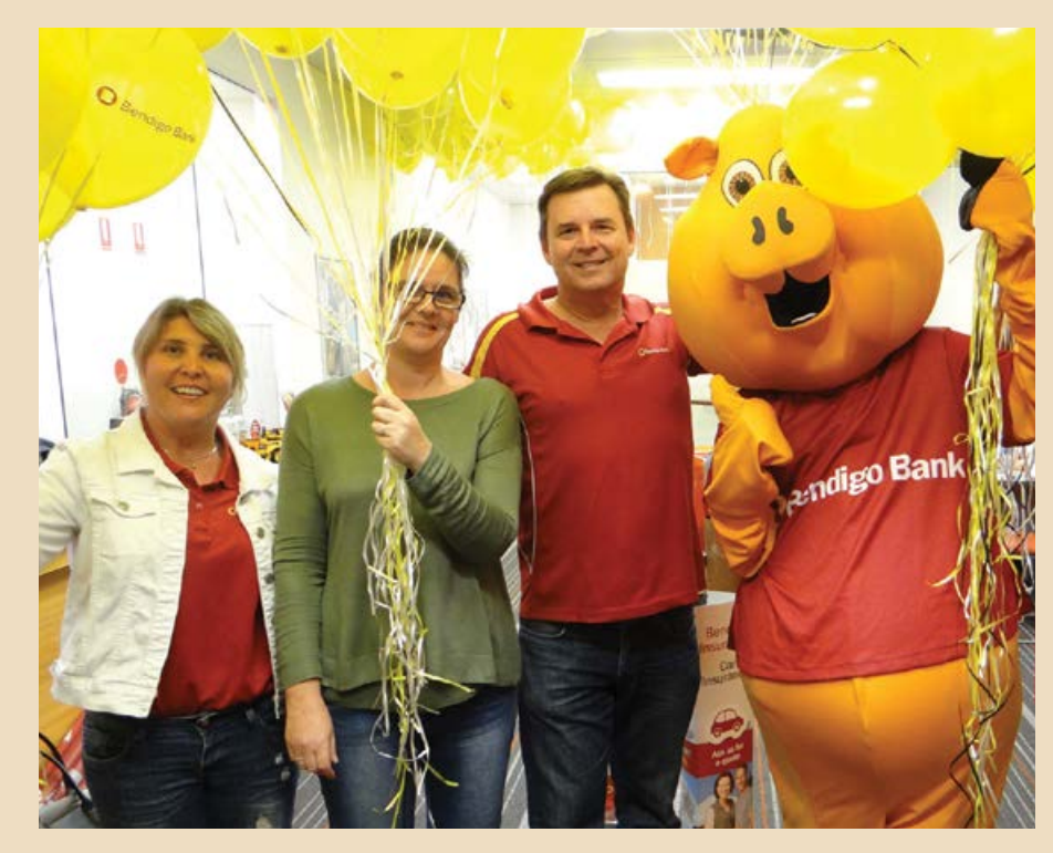
Keeping customers satisfied is our highest priority.

If you're looking for a bank that knows how to look after its customers then call us on 5456 2094 or visit us at 72 Burnett Street, Buderim.