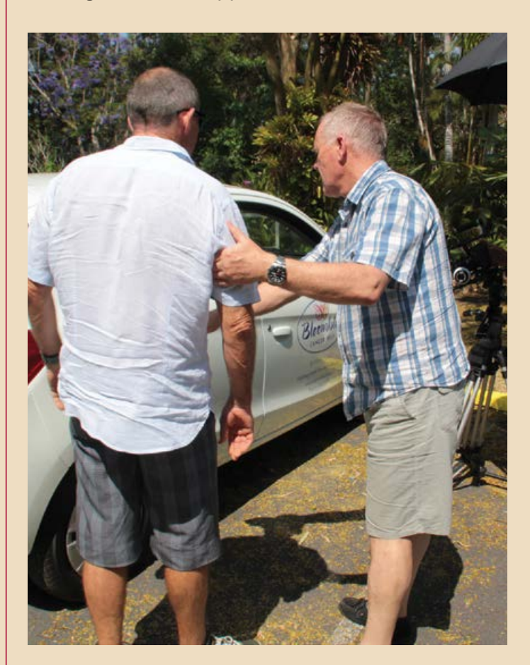
Bloomhill provides a range of services including transport to appointments.

It's with heartfelt appreciation we thank Bloomhill Cancer Care for their ongoing role in our community and we look forward to providing support for many years to come.