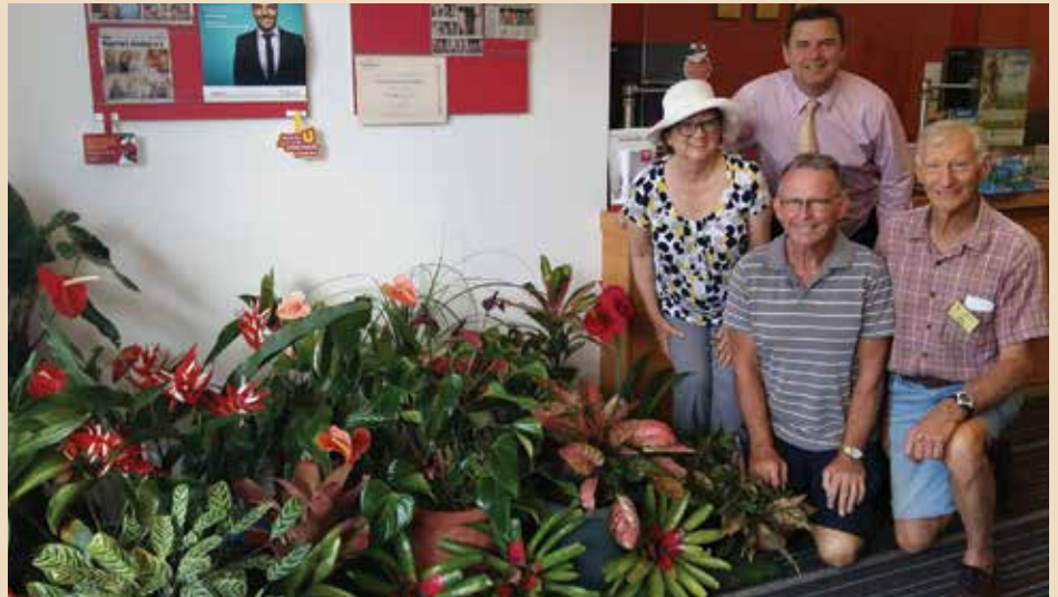
Above: The Buderim Garden Club build a garden display in branch.