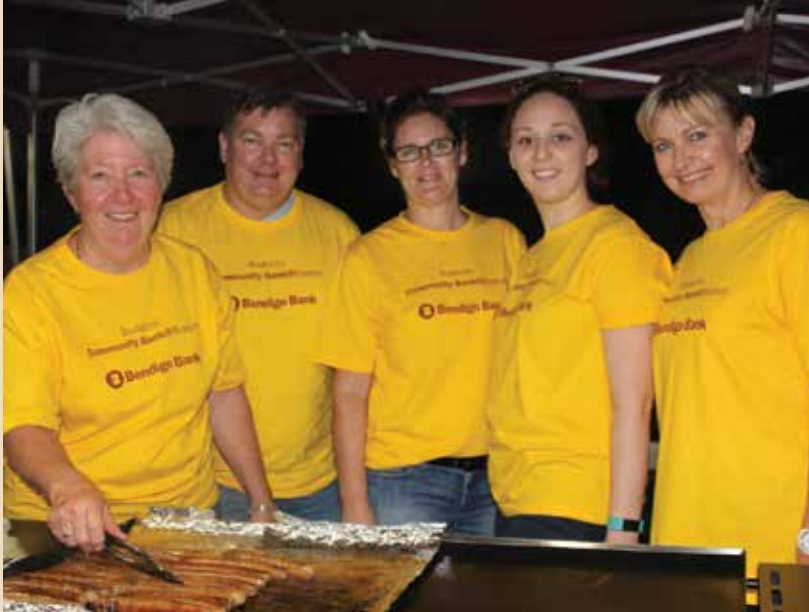
Above: The branch team volunteer their help at the school movie night.

During the last year, our Buderim Community Bank ® Branch has got on board with the Buderim Mountain State School as sponsor of the school's 'Movie Under the Stars nights'.