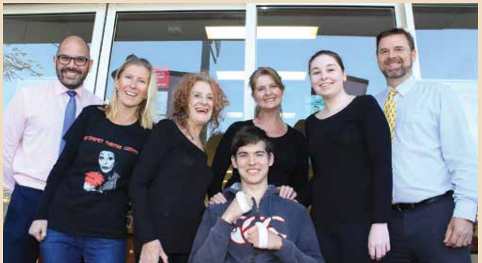
Above: The cast of ‘Becoming’ gather in Buderim ahead of their performance.

The Theatre Alliance includes ten theatre groups from Caloundra to Noosa, which stage regular live theatrical productions throughout the year.