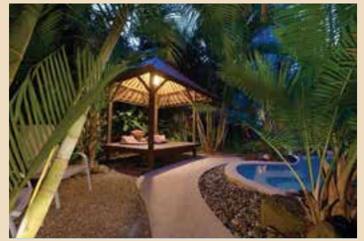
Above: Alaya Escape.

It's great to see the prize go to such a deserving recipient!