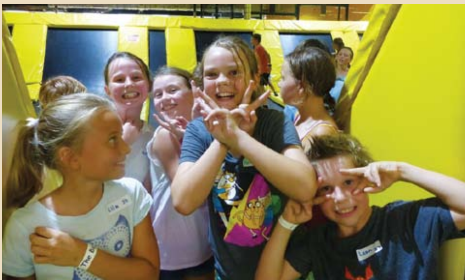
Top right: Rebels Hockey Team Builder event brings smiles to everyone's faces.

The branch team enjoyed a night of networking with parents sharing in the fun and enjoying the sausage sizzle. Parents were encouraged by the Community Bank ® branch team's presence knowing the branch's sponsorship underpins their financial outlays throughout the year.