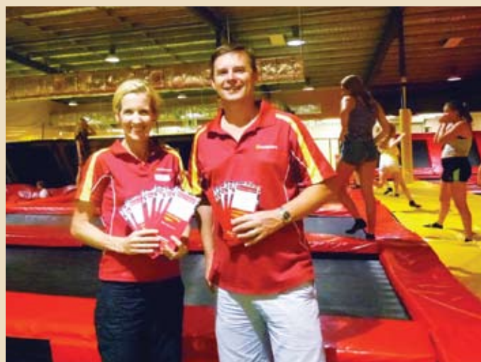
Right: The branch gets in on the action!