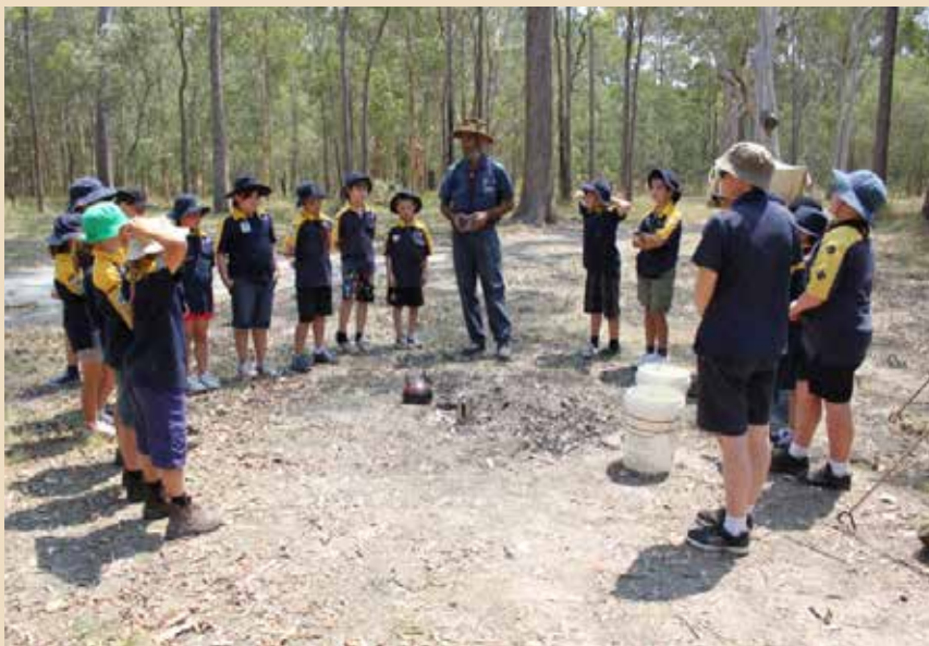
Kawana Scouts role-playing.

As a global movement, Scouts has made a real contribution to creating a better world over the past 37 years and we here at Buderim Community Bank ® Branch salute them for their tremendous support of our Sunshine Coast youth.