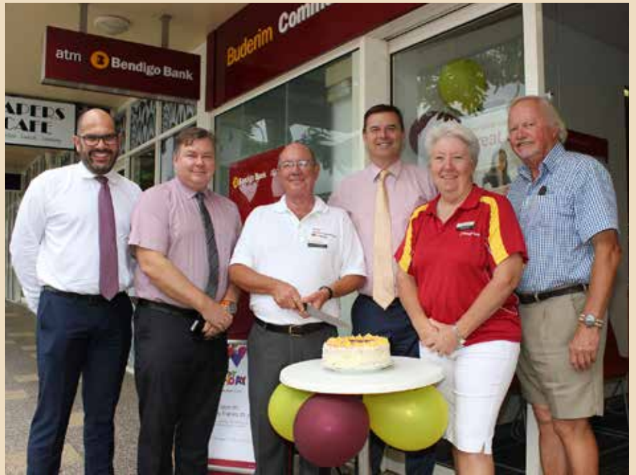
Directors and Buderim Community Bank ® Branch staff celebrate our seventh birthday.

The contribution to these organisations have been made because Buderim residents, traders and community organisations have all learned the benefits of banking locally.