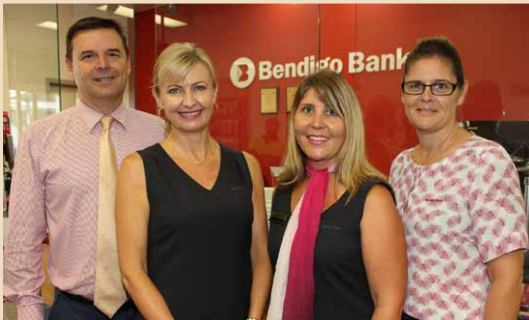
EOFY is a great time to visit the branch team and Business Banking Manager to discuss your financial needs.

We know what you're thinking, where has the year gone? If you're anything like most other Australian small business owners, that means piles of paperwork and shuffling through the filing cabinets, office desk draws and shoe boxes for receipts that you promised yourself last year would be filed more efficiently. Don't worry, we have put together a short list of tips that will make your EOFY slightly more bearable and keep you organised and prepared for the new financial year.