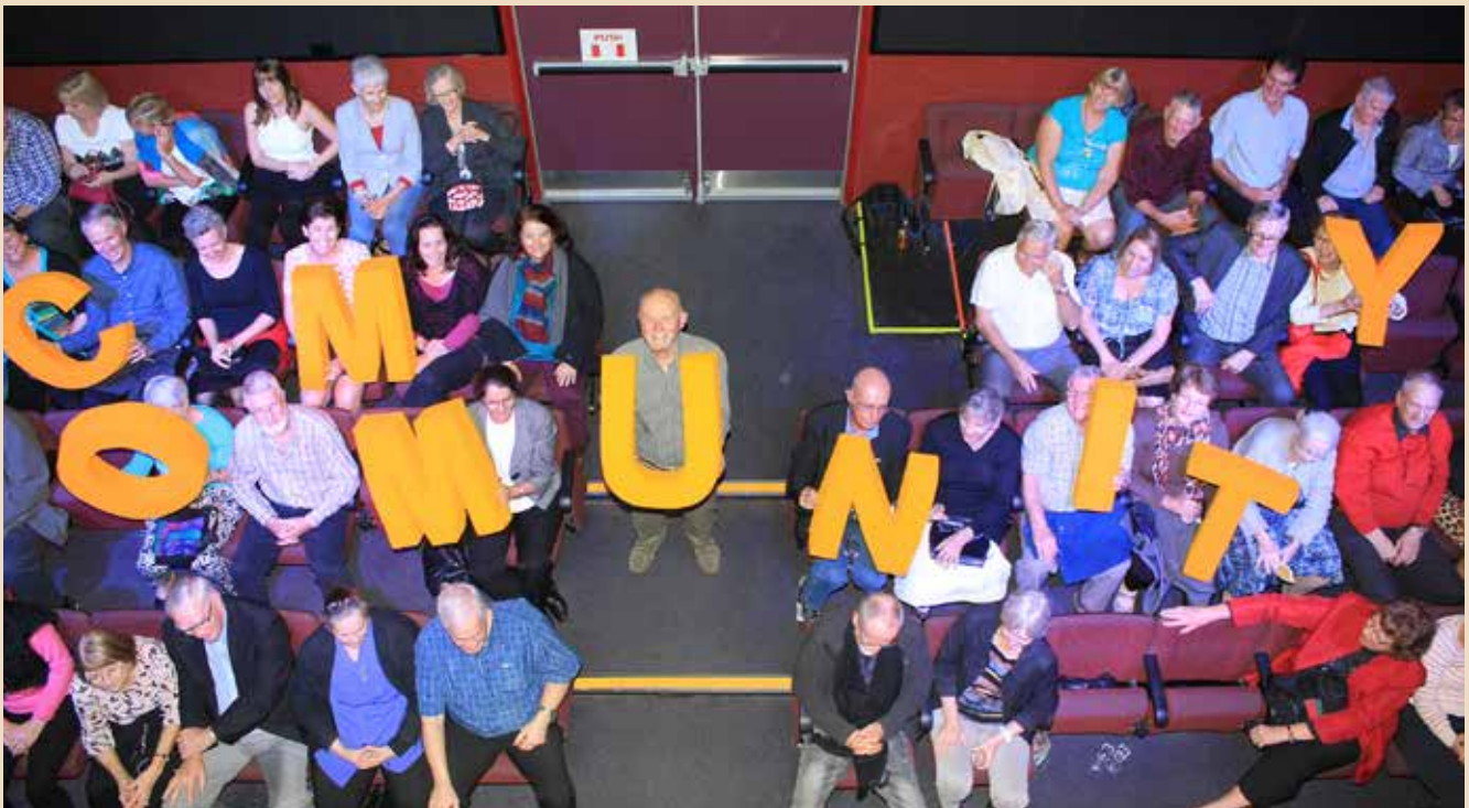
Sunshine Coast Alive tickets on sale soon.

Our Sunshine Coast Community Bank ® branches have contributed ongoing funding to Sunshine Coast Alive over the past five years and remain committed to nurturing our creative talents on the Sunshine Coast.