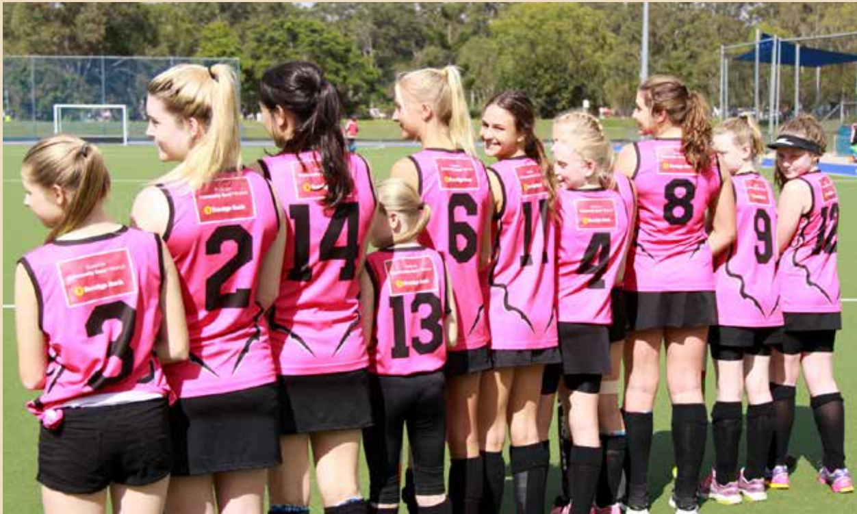
Buderim Junior Rebels Hockey Club attracts record numbers.

The Club has also been fortunate to have received equipment grants from Buderim Foundation for the Schools and Hookin2Hockey program, and the Sunshine Coast Council for new team management kits.