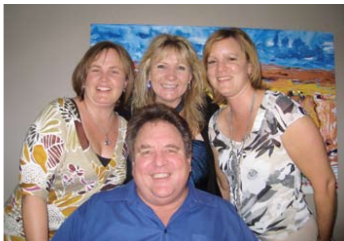
▲ Celebrating winning Branch of the Month.