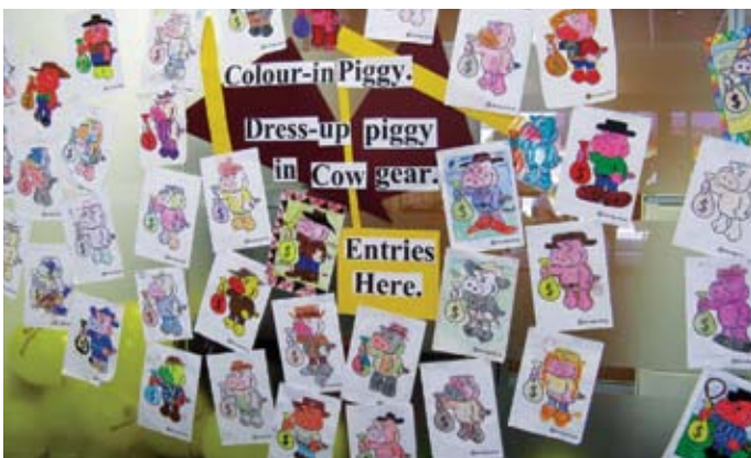
▲ Piggy Colouring Competition.