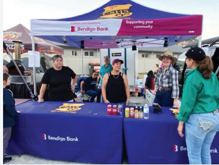
You can always find us around our community – supporting the Calliope State School P&C Association (above) and our Gladstone branch team out and about (left).