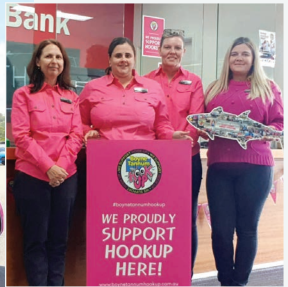
We proudly support the Boyne Tannum Hookup, Australia's Biggest Family Fishing Competition. This year's event will be held 29 April - 1 May.