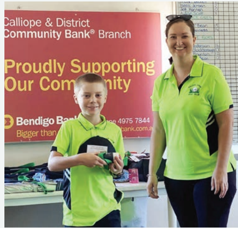
Junior golf championships at Calliope Junior Golf Club.