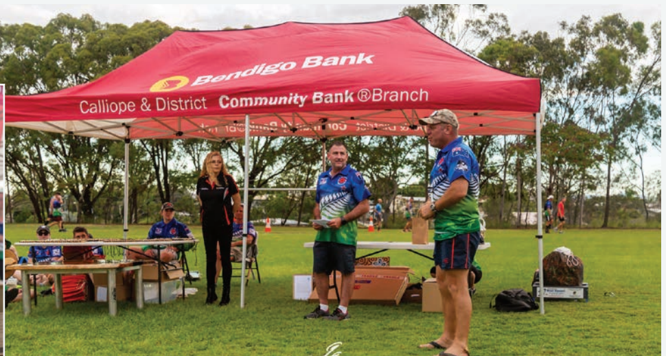
We were on hand to help present medals at the Walking 4 Warriors Endurance Challenge.