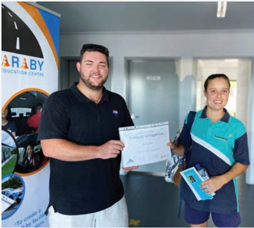
Supporting our young learner drivers through the Drivers Awareness Course.