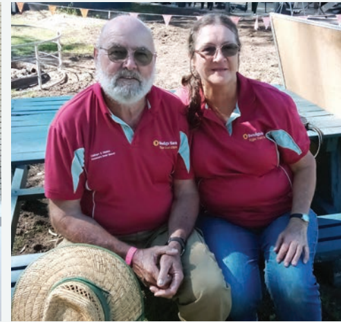
Enjoying the Boyne Valley Country Music Campout 2021.