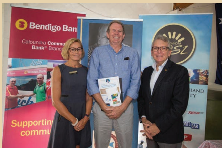
Nominate now for the Caloundra Community Electorate Awards.

Nominations close Friday 27 September with the awards being presented on Friday 11 October 9.30 – 11.30am at the CCSA Hall, 1 Nutley Street, Caloundra.