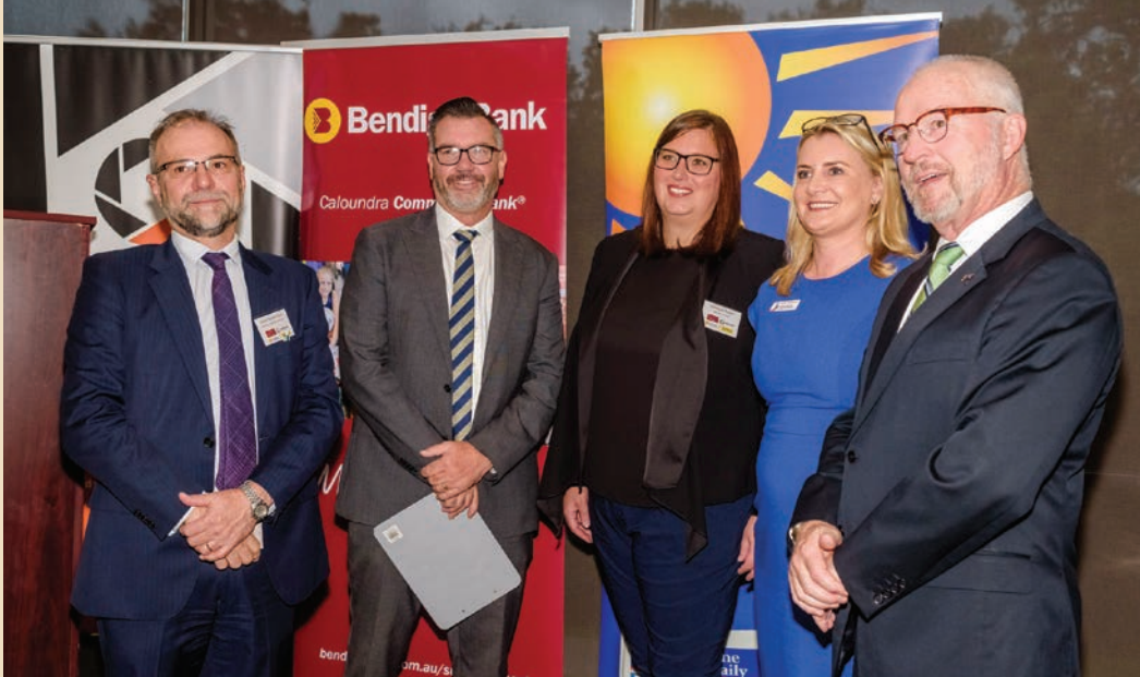
The regional snapshot panel of experts join with the Caloundra Chamber of Commerce.

We need to continue to work together to support this migration. Ongoing investment in infrastructure and our digital future are paramount to our success. A friendly welcome from local businesses and the community is also well received by our new residents.