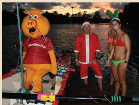
Left: Piggy joins the boat spectacular.