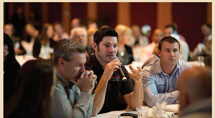
Partnering for success.

Partnership objectives can range from growing brand awareness to increasing brand sentiment and creating lead generation. Perhaps the objective is to grow your leadership capacity or to align with influential stakeholders in the community. There's a whole range of objectives that might be important to you and your business.