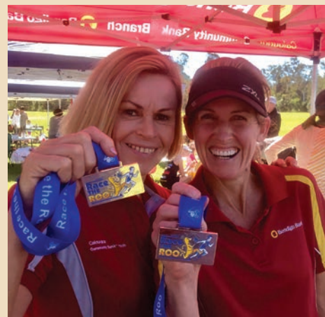
Top: Our team were kept busy from start to finish on the BBQ.

After such a successful first year of the new event format, we look forward to seeing Racing the Roo gain even more momentum in 2020.