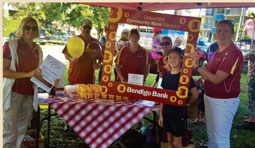
Top: Our branch-sponsored Petting Zoo is a family favourite day.