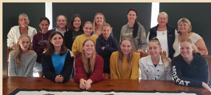
An umpire appreciation brunch brings plenty of smiles.

With the end of season fast approaching, Moffat Beach Netball Club is expected to be well represented in the finals. To show their appreciation for all the support, the Club recently held an umpire appreciation brunch to give thanks to all the fabulous umpires who do a fantastic job umpiring on Saturday mornings.