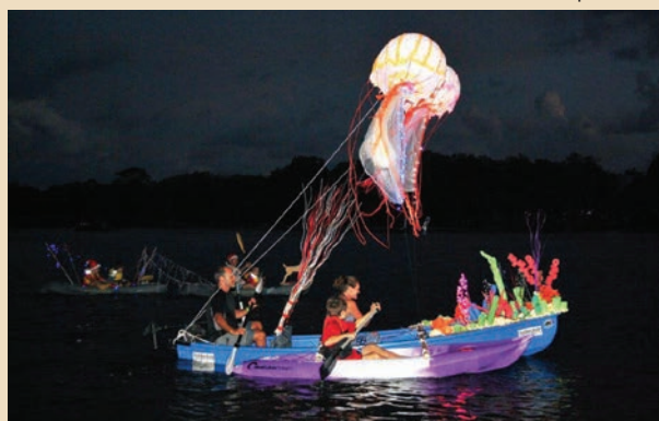
Below: Another winning entry in the Lights on the Lake boat parade.