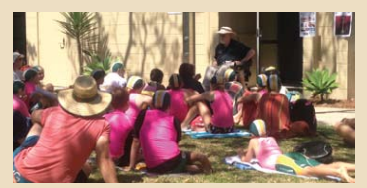
Above: The Paraplegic Benefit Fund deliver water safety advice to the Dicky Beach Surf Life Saving Club nippers.

Dicky Beach Surf Life Saving nippers are now wiser when it comes to water safety, thanks to the Caloundra Community Bank ® Branch's sponsorship of the Paraplegic Benefit Fund (PBF) and its PBF Aqua Program.