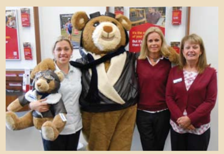
Above: The branch joined with Careflight in support of Chopper Awareness

Bendigo Bank has been a long-standing supporter of CareFlight since 2005 and has hosted Chopper Awareness Month for the past six years.