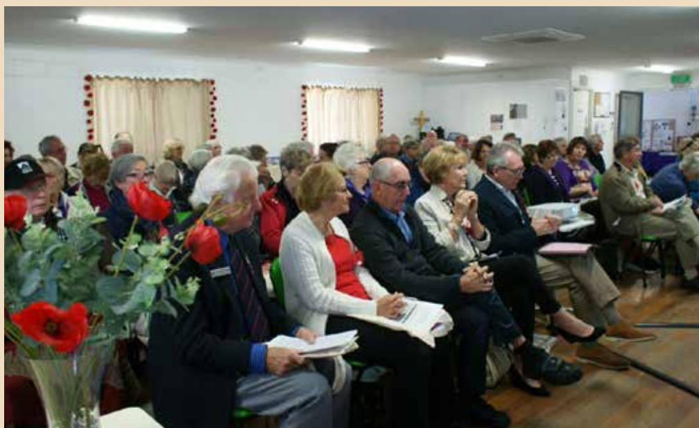
Left: The World War 1 seminar was well attended.

Over 80 people attended the day as they ventured together into this fascinating world of history.