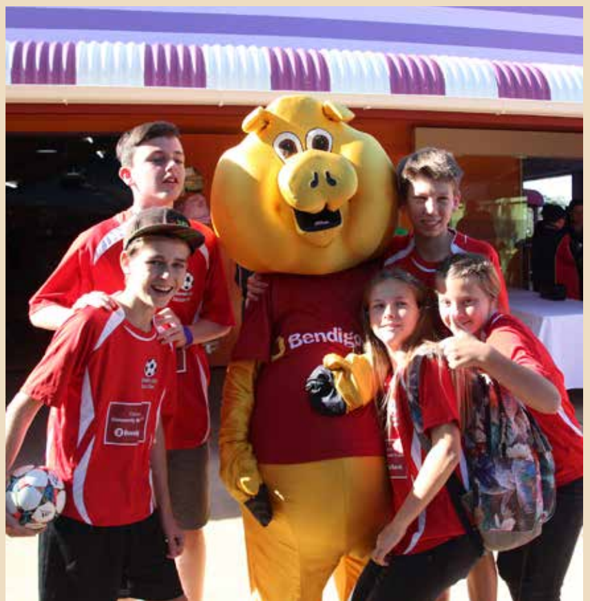
Right: Piggy joins in the fun at the Caloundra City Soccer Club end of season celebrations.