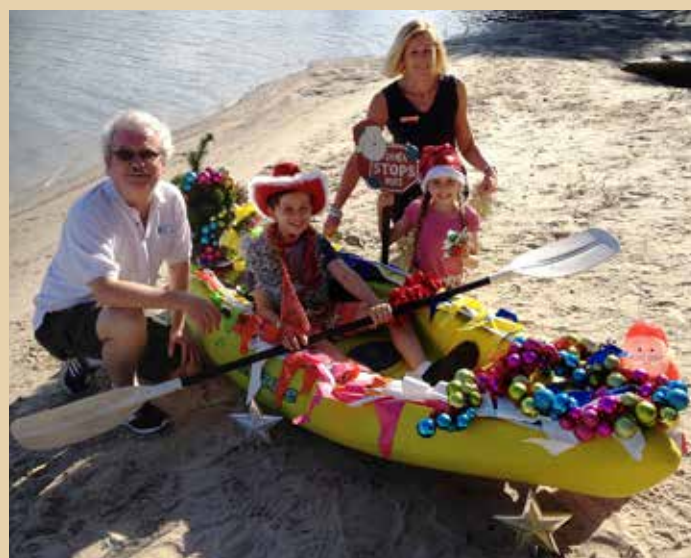
Above left: Piggy proves popular with the little ones. Above right: Getting ready for the Lights on the Lake spectacular. Top: Currimundi Netball Association season opener.

Caloundra Community Bank ® Branch is again a major sponsor and will partner with Dicky Beach Surf Life Saving Club to light up the nights' sky with a decorated inflatable rescue boat. It's one of numerous community activities undertaken by the branch throughout the year.