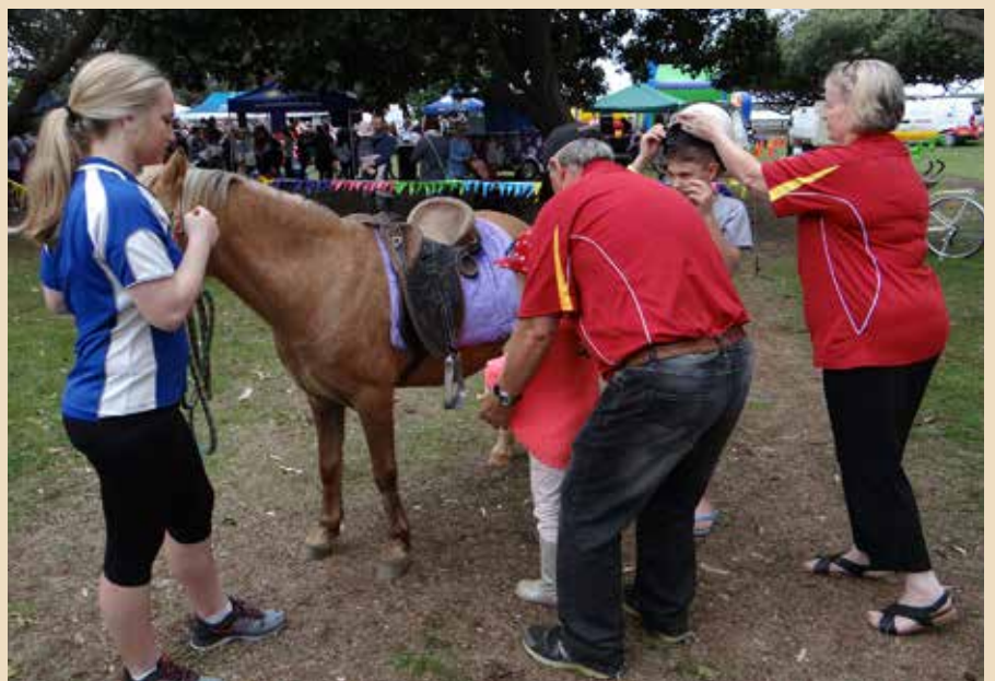
Above right: The petting zoo was again a popular attraction for families.