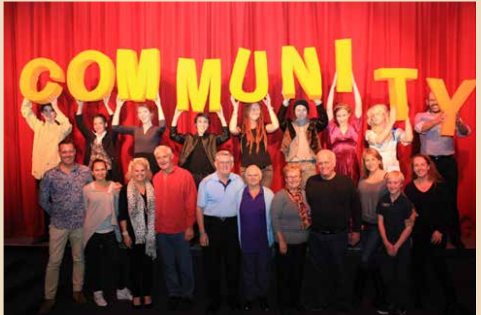
Above: Lind Lane audiences gets into the community spirit during the Festival.

The Theatre Alliance includes ten theatre groups from Caloundra to Noosa, which stage regular live theatrical productions throughout the year.