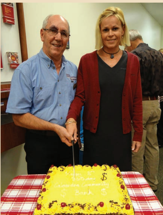
Over 220,000 reasons to celebrate our 12th birthday.

Drop in to see Pip and the team at 99 Bulcock Street Caloundra or phone 5492 5267 to find out more.