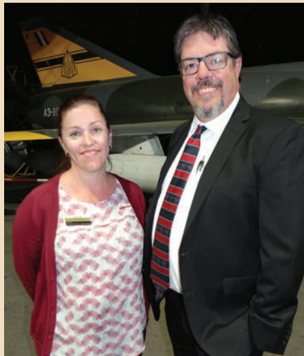
We pride ourselves on delivering first-class customer service every single time.