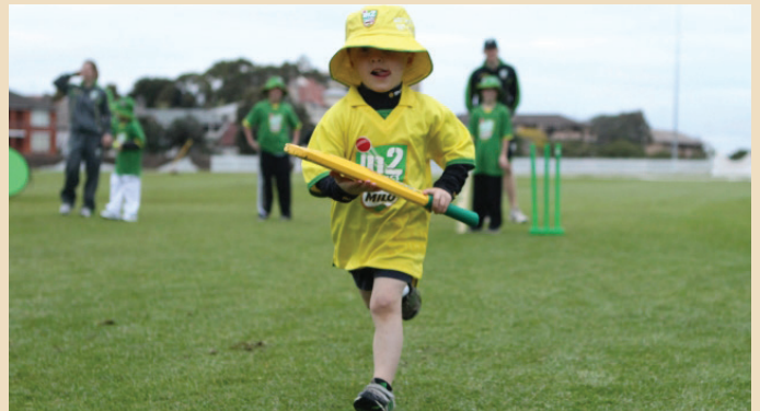
Caloundra Cricket Club caters to all ages and skill levels.

We wish the players all the very best for the last few weeks of the season and look forward to seeing our local families and visitors also showing their support at Henzell Park.