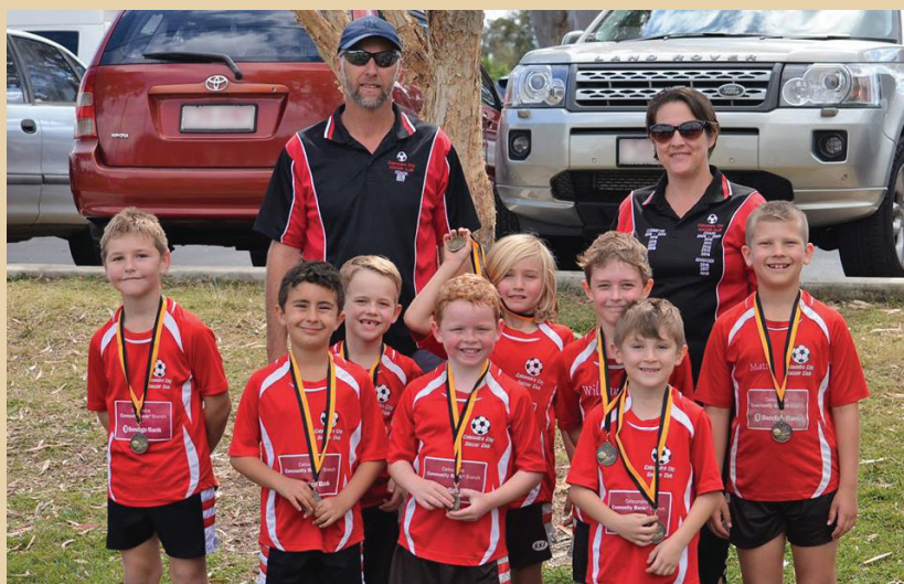
Caloundra City Soccer U8 Black team at a recent Roo Ball Carnival.

We'd like to take this opportunity to wish all players and teams a very successful season ahead and will be following your progress with great interest.