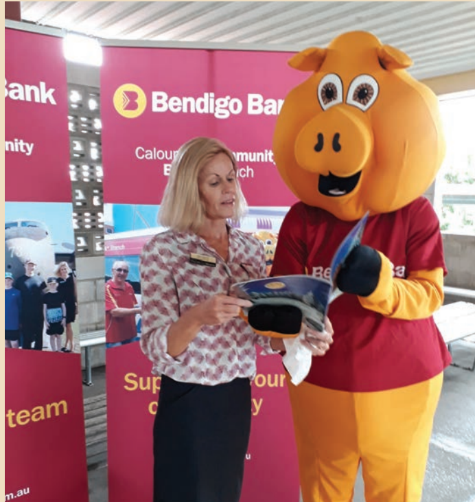
Piggy Classroom delivers financial literacy to our Sunshine Coast schools.

For those who might not already be familiar with Piggy Classroom, it's a collaboration between Skoolbo and Bendigo Bank that delivers a reading, maths and languages program for primary school students. The initiative came about because of the increasing need to provide financial literacy to kids. We saw the gap and we're happy to say that after launching in mid-2017, we're seeing some real success.