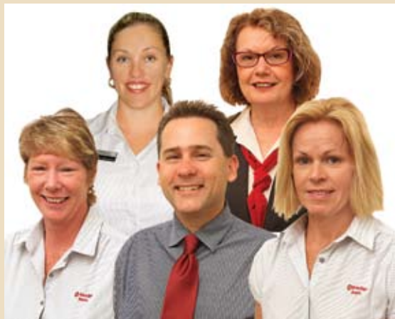
Caloundra Community Bank® Branch staff deliver on our promise to be Bigger than a bank .