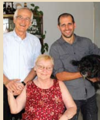
The Caloundra Community Centre celebrates its first birthday.

It's the success of your business. But it's bigger than that.