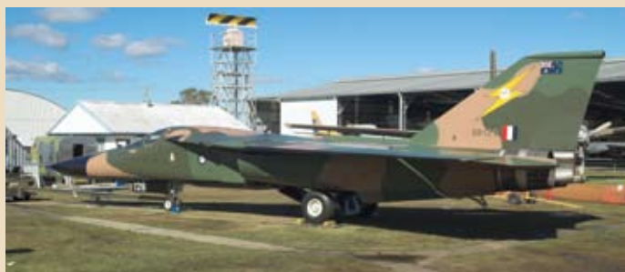
Queensland Air Museum is a popular destination for visitors.

The arrival of the F111 last year had a significant impact on the popularity of the museum. But it's not only the F111 that is drawing the huge crowds. The Queensland Air Museum is home to the largest national collection of military and civilian aircraft