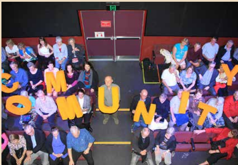
Sunshine Coast Alive tickets on sale soon.

Sunshine Coast Live coordinates two major events each year. Along with the Festival, Sunshine Coast Live also hosts a Season Launch Soiree as well as workshops and events aimed at improving the standard of theatre on the Sunshine Coast.