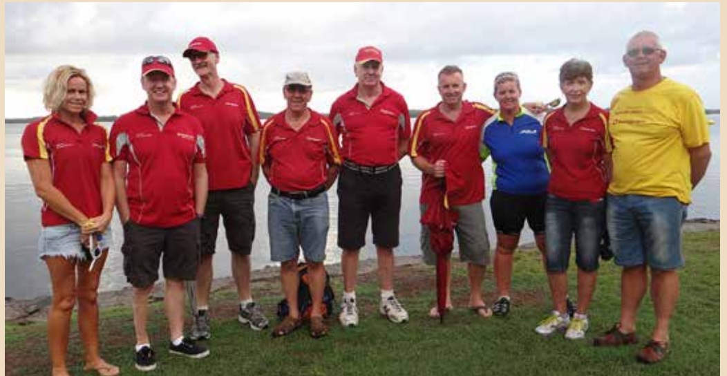
Caloundra Community Bank ® Branch team volunteering at Caloundra Just Tri It Series.