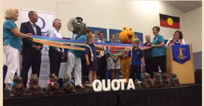
The launch of the QuoCKa Reading program at Caloundra State School's assembly.

The project has the support of the Caloundra Police (and District Officers) and the Adopt-a-Cop program. Joining local police are Quotarians, Junior Quotarians, high school students, local politicians, sporting heroes and our Caloundra Community Bank ® branch staff all volunteering their time on a weekly basis to read with the students.