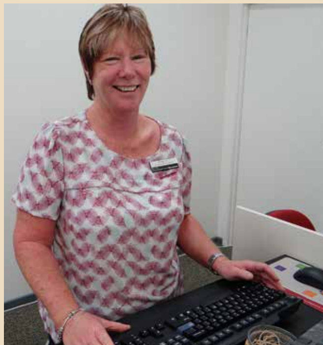
EOFY is a great time to visit the branch team and Business Banking Manager to discuss your financial needs.

When was the last time you reviewed those unpaid invoices that started in the 30 day column but have somehow managed to be now in the 90/120 day columns? Consider printing your Aged Debtors Ledger (detailed) and review what attempts have been made to collect the outstanding amounts. Are payment plans in place or are these bad debts in disguise? If you have outstanding invoices that you believe are 'write offs' consider discussing the deductibility of these in the current financial year with your accountant or tax specialist. Moving into the new financial year, prevention is always better than a cure, when was the last time you reviewed your trade credit terms, debtor insurance and a professional collection service?