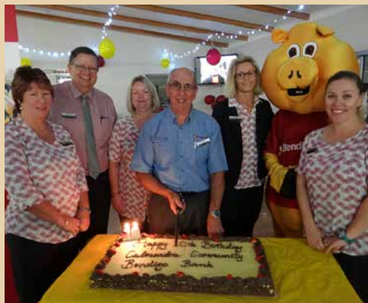
The branch team celebrates its 10th birthday.

“We will continue to share this success with our community through future support of local organisations and through our shareholder dividends.”