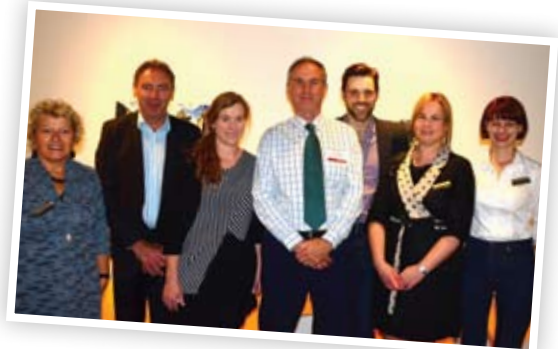
Above: Clifroy Directors at the 2012 AGM at Arts Project Australia.

Applications for sponsorship in round two can be lodged via our online application form ( www.facebook.com/clifroybank ) until 31 March 2013, and successful applicants will be announced within six weeks.