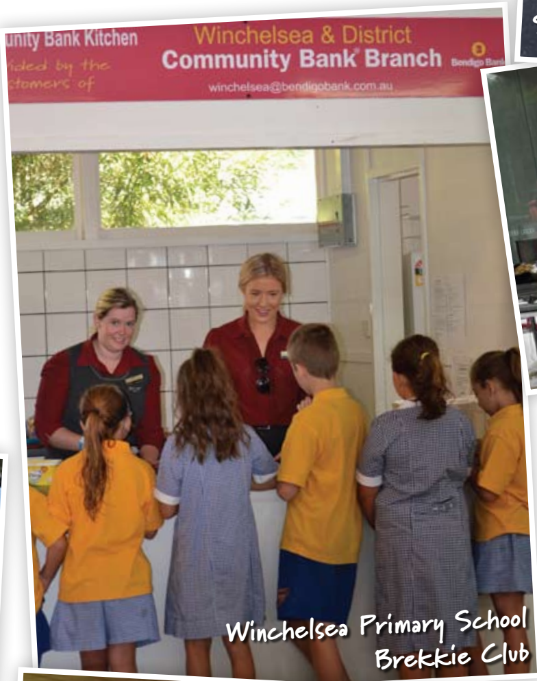
Winchelsea Primary School Brekkie Club