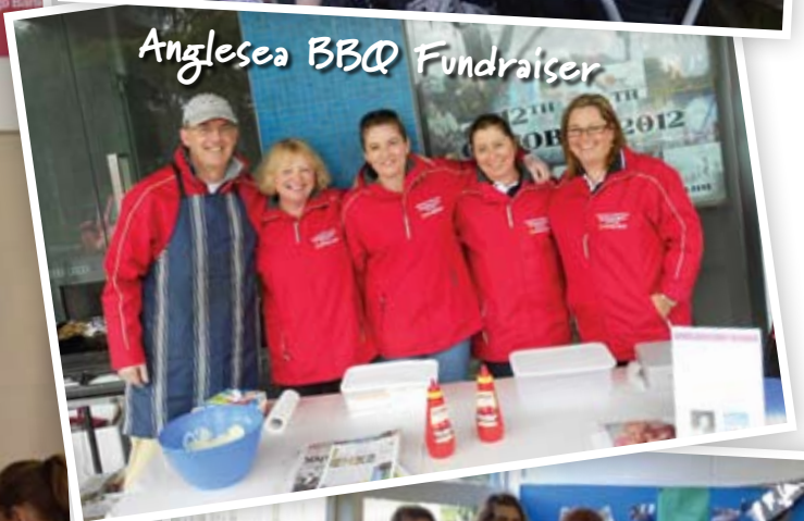
Anglesea BBQ Fundraiser