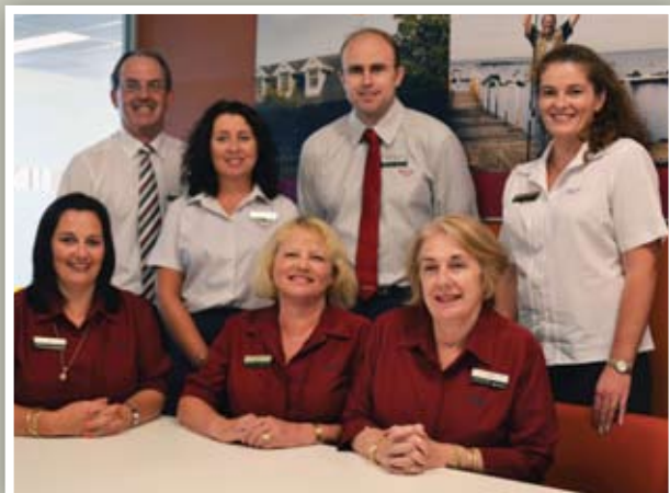
Anglesea & District Community Bank® Branch staff.