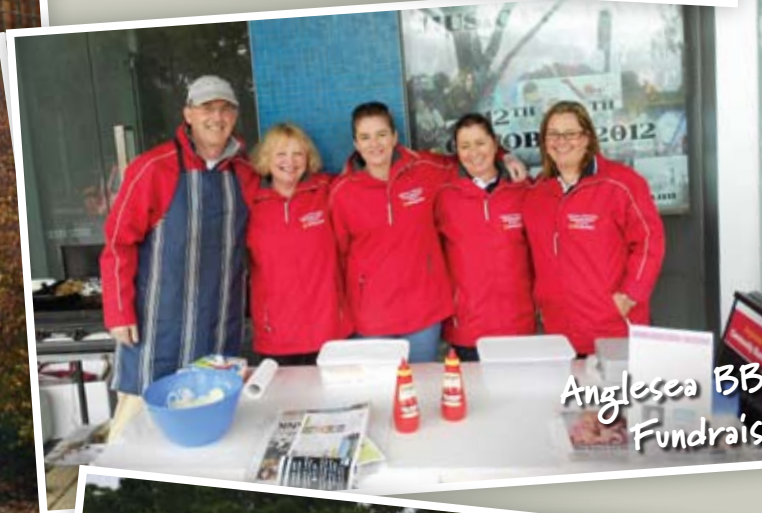
Anglesea BB Fundrais