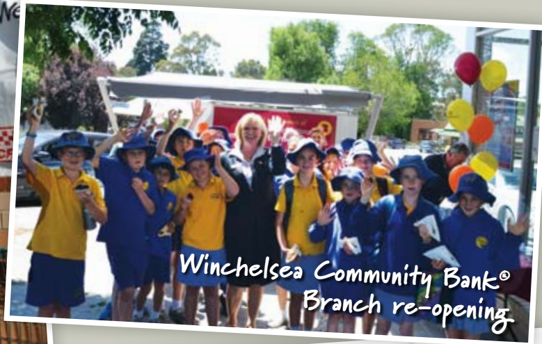
Winchelsea Community Bank ® Branch re-opening