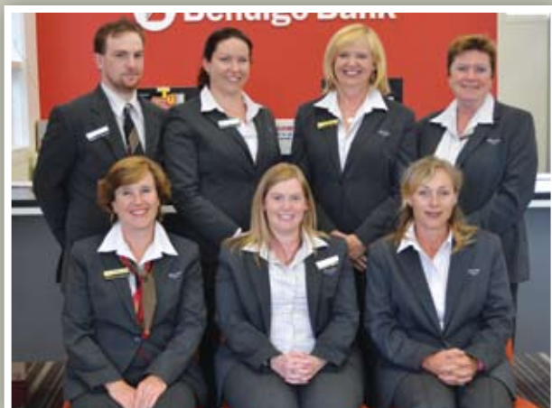
Winchelsea & District Community Bank® Branch staff.