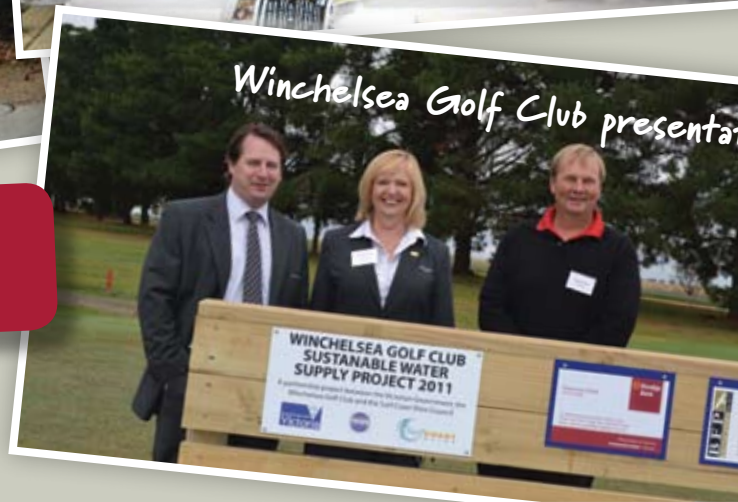
Winchelsea Golf Club presentation