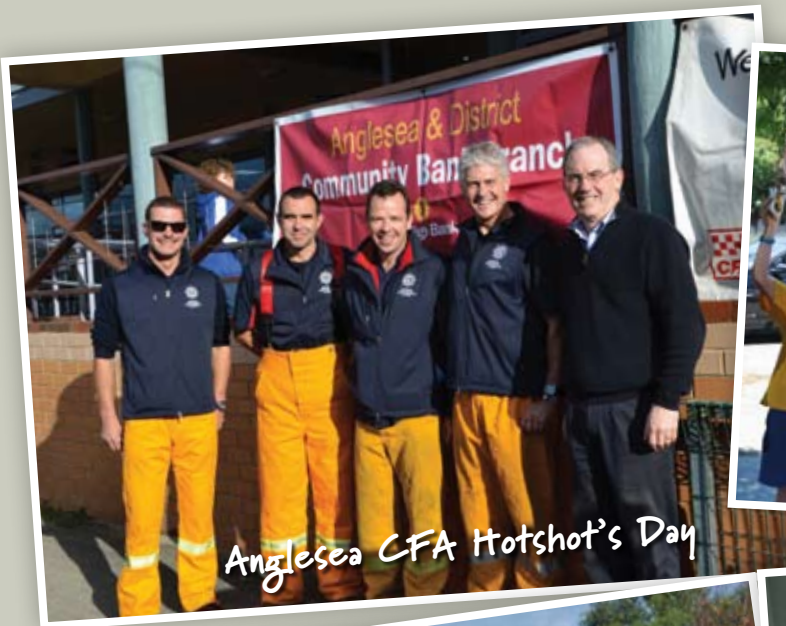
Anglesea CFA Hotshot's Day