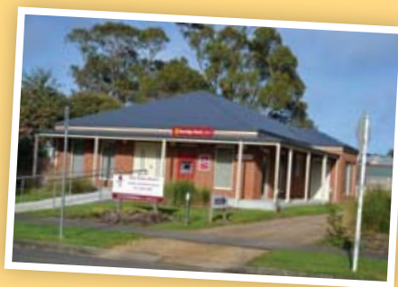
Moriac Community Health Centre.

Moriac now has 24 hour access to cash following the installation of a Bendigo Bank ATM at the Moriac Community Health Centre.