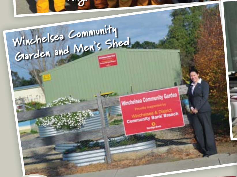
Winchelsea Community Garden and Men's Shed