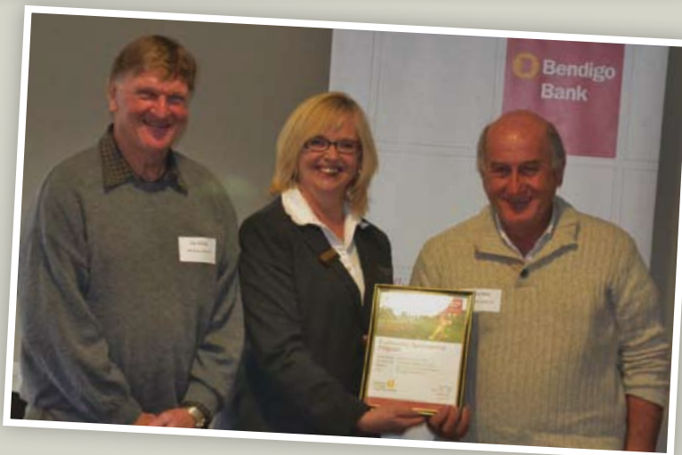
Above: 2013 Sponsorship Presentation.

Corangamite Financial Services Ltd have contributed over $800,000 to local groups and organisations and it is through your banking business held at our branches, which gives us the ability to support our communities.