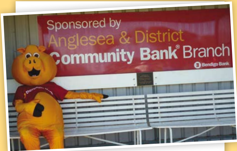
Above: 'Piggy' taking a well-earned rest at 'Triple for Triers'.