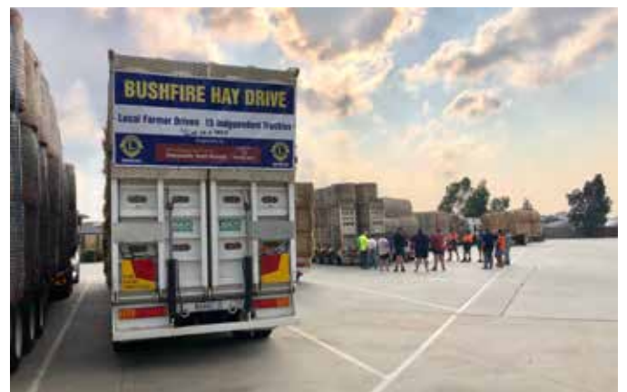
Support for bushfire devastation.

Australia has been extraordinarily generous in the aftermath of the devastating bushfires with many charities overwhelmed with food, clothing and finances. With so much farmland destroyed, the pressure on the remaining animals to be retained and fed created a major problem. Stock feed was an urgent requirement into Gippsland and the call from farming groups was answered in a collaborative effort with $5,000 coming from the Winchelsea Lions Club, $6,000 from the Anglesea, Lorne and Winchelsea Community Bank to provide hay deliveries to the most affected areas. The Torquay Bendigo Bank Connected Communities contributed $4,000 to show the strength of collaboration. These deliveries of hay provided an important buffer of nutrient for the farm animals until autumn grass growth was established.