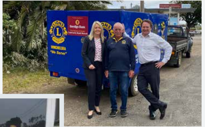
Winchelsea Lions Club.