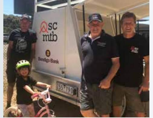
Surfcoast Mountain Bike.