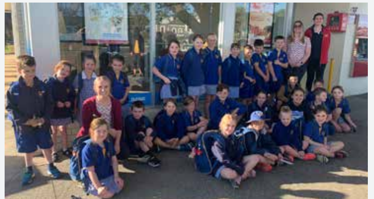
Winchelsea Primary School.

Front page: Representatives from our Community Bank, Lions Club of Winchelsea, local farmers, organisers and contributors of the hay drive.