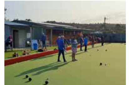
Triples for Triers 2020.