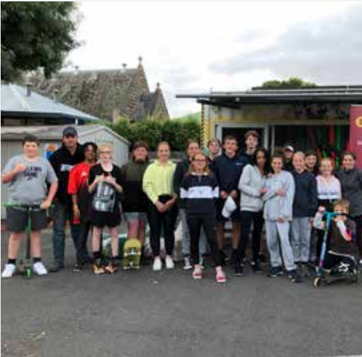
Winchelsea Youth and Leisure Drop in.