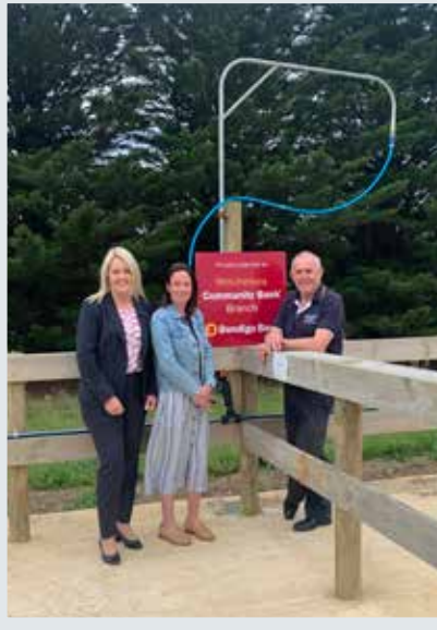
Top centre: School banking.