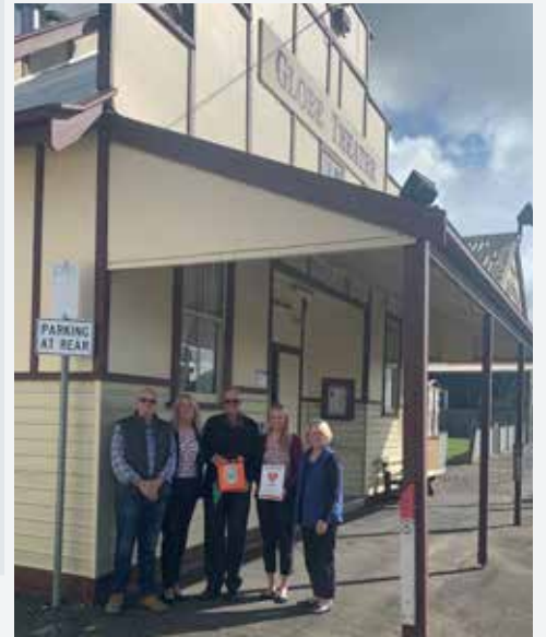
Winchelsea Globe Theatre.