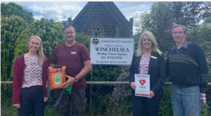
Winchelsea Uniting Church.