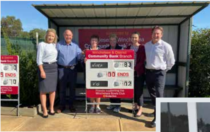
Winchelsea Bowls Club.