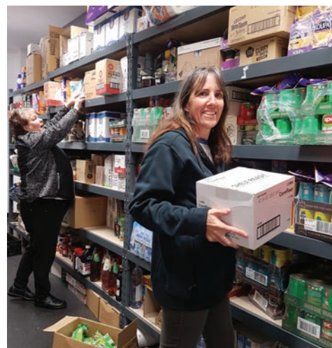
Volunteers at Foothills Community Care Community Casseroles (left) and Dandenong Ranges Emergency Relief Service (right).