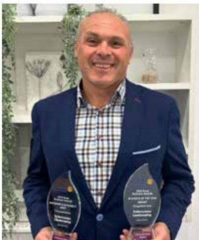
Business Award Winner and Environment & Sustainability Winner – Yellowstone Landscaping

The Knox Business Awards is an inspiring celebration of local achievement and innovation, recognising the remarkable businesses that shape the vibrant Knox community. Proudly sponsored by Community Bank Wantirna and made possible through the partnership of Knox City Council and the Rotary Club of Rowville-Lysterfield, this event highlights the outstanding contributions made by businesses across various industries in the region.