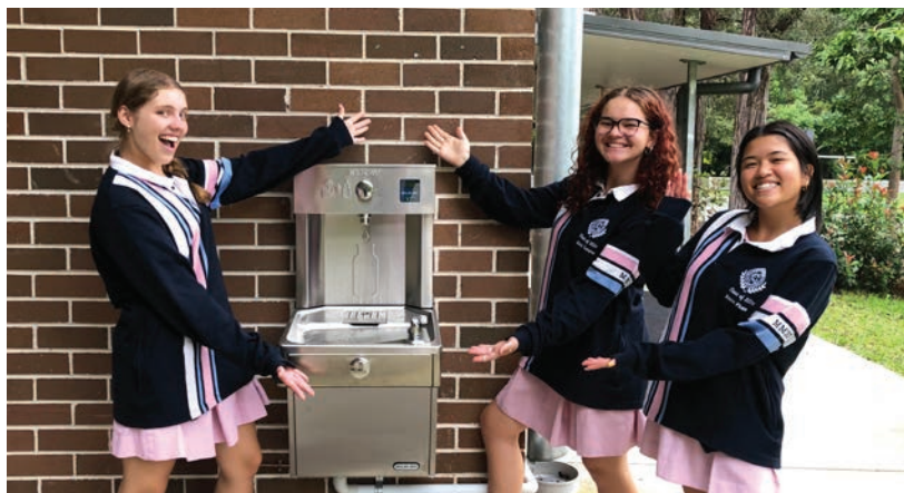
Above: Cheltenham Girls' school captain, vice-captain and prefect showing off the water station

Cheltenham Girls wanted to add an additional water station (cool filtered water to refill drink bottles) close to their new multi-purpose centre and sports oval. At Epping Boys, the bank gave a grant to install two additional flag poles – to display the Aboriginal and Torres Strait flags beside the Australian flag.