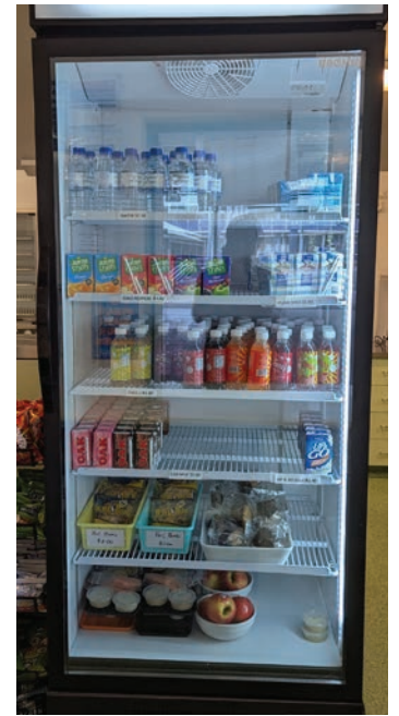
Eastwood Heights PS