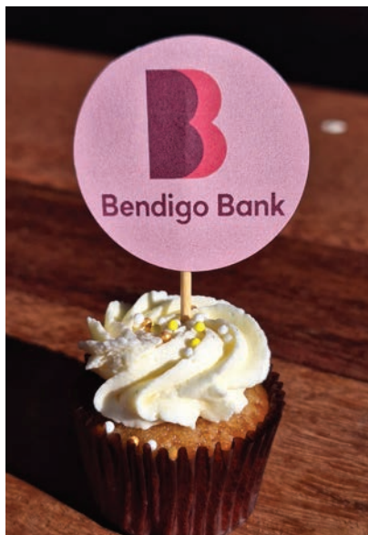
Denistone East Public School