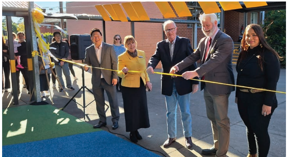
Denistone East Public School