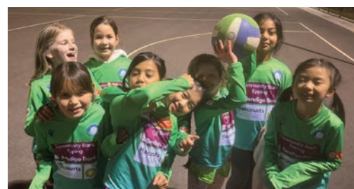
Clockwise from top left: Beecroft Football Club, Epping Rams Rugby Club, Epping Eastwood Football Club, Carlingford Netball Club