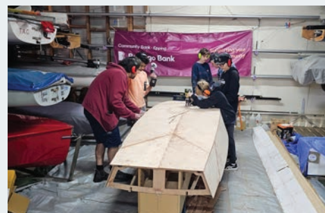
From left: Indian Seniors Group, KidsXpress, Concord Ryde Sailing Club