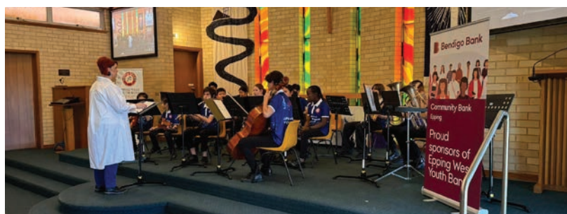
From top: Good Life Chorus, Macquarie Singers, Epping West Youth Band