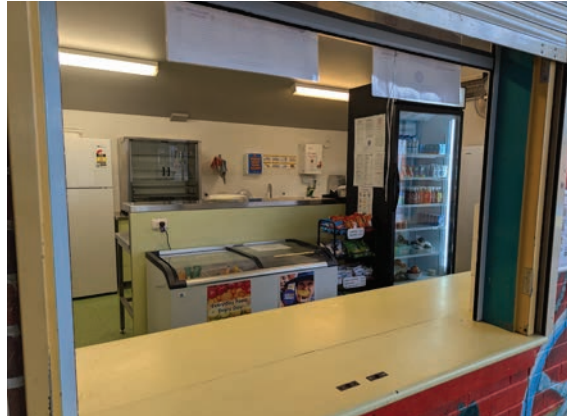
Eastwood Heights PS

Other projects underway but not yet completed include facilities at Epping Boys High School, West Epping Public School and the end of year carols evening at Epping Heights Public School.