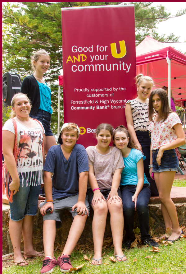
Breakfast in the Park 2012