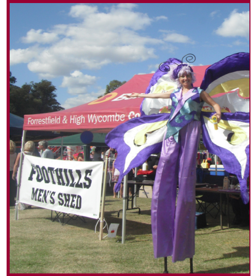
Foothills Men's Shed.