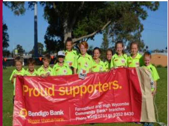
Kalamunda Lesmurdie Little Athletics Club