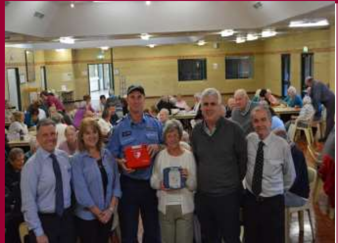
Launching of our Defibrillators programme