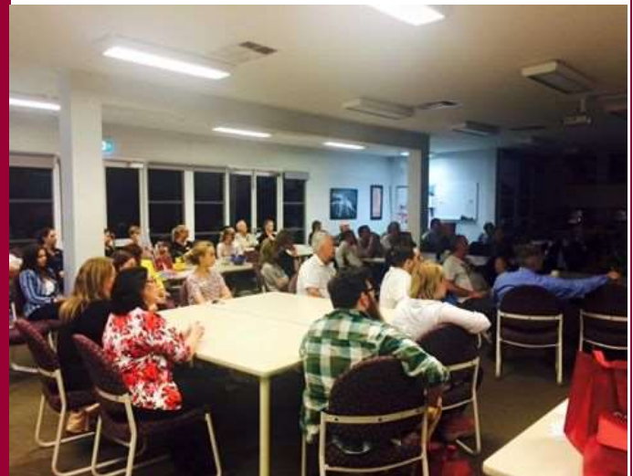
1 st Branch Wealth Seminar held in November 2015