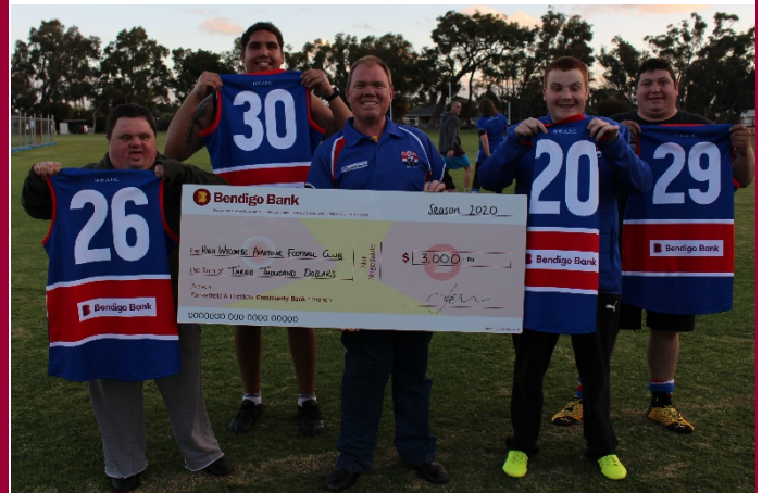
Players from the High Wycombe Amateur Football Club integrated team proudly showcasing their new playing jumpers sponsored by Community Bank Forrestdfield & High Wycombe Bendigo Bank.